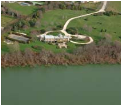
Bridgehampton South. Morgan Hill. WEB# 47191 12,000 SF +/-, 9 bedroom, pool, tennis, 11.5 acres.