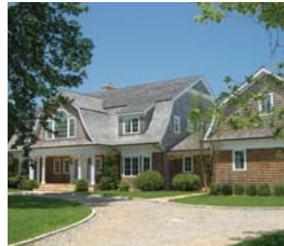
East Hampton South. Pondview. WEB# 47769 5,000 SF +/-, 6 bedroom, pool, pool house, 1 acre.