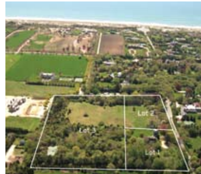
East Hampton South. Estate Lots. WEB# 44738 3 separate parcels, tennis, 2.3, 2.7 & 6.5 acres.