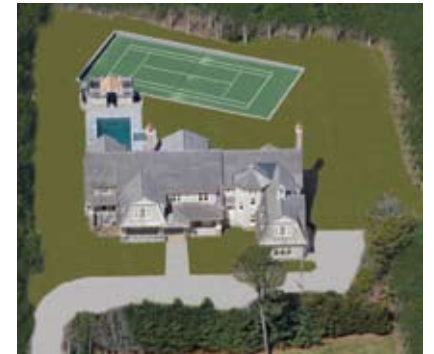
East Hampton South. Georgica. WEB# 41932 7,800 SF +/-, 8 bedroom, pool, tennis, 1.63 acres.