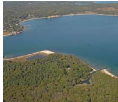
North Haven. Tyndal Point. WEB# 52126 3,000 ft. of waterfront, 3 houses, dock, 55 acres.