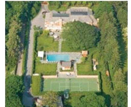
Water Mill South. Cobb Road. WEB# 34350 8,500 SF +/-, 7 bedroom, pool, tennis, 2 acres.