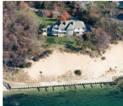
North Haven. Baywatch. WEB# 83352 6,100 SF +/-, 6 bedroom, pool, tennis, 2.6 acres.