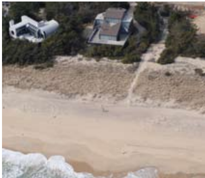
Amagansett. Life Is A Beach! WEB# 50763 3,500 SF +/-, 5 bedroom, oceanfront, 3/4 acre.