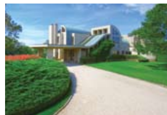
Bridgehampton. $19.995M WEB# 47191