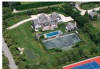
Bridgehampton. $10.7M WEB# 22445