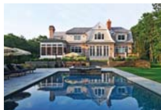
Amagansett. $4.75M WEB# 22447