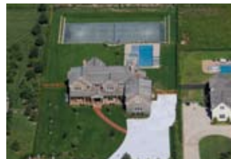
Water Mill. $4.675M WEB# 53422