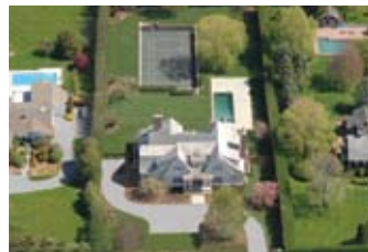
Water Mill. $11.495M WEB# 52422