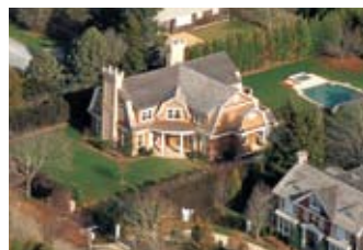
Southampton. $7.9M WEB# 49746