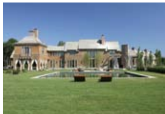
Bridgehampton. $12.9M WEB# 54711