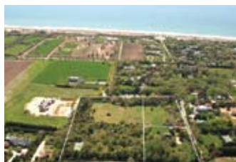
East Hampton. $21M WEB# 44738