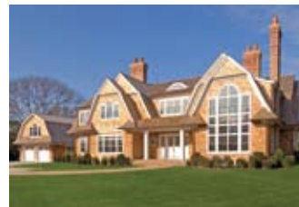
East Hampton. $11.45M WEB# 52844