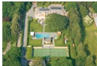
Water Mill. Price Upon Request. WEB# 34350