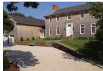
Amagansett. $3.95M WEB# 53617