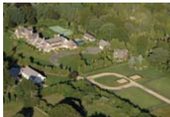
East Hampton. Price Upon Request. WEB# 52610