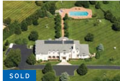
Southampton. $8.7M WEB# 43597