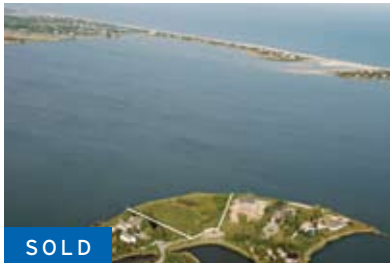
Water Mill. $16.995M WEB# 05304