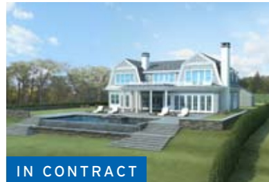
Sag Harbor. $7.95M WEB# 46720