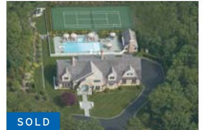
Water Mill. $5.75M WEB# 65465