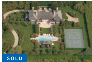
East Hampton. $15M WEB# 40937