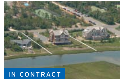
Southampton. $4.995M WEB# 34017