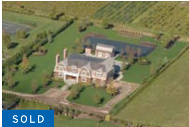
Bridgehampton. $5.25M WEB# 42989