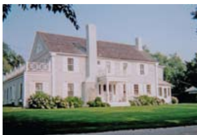
East Hampton. $7.25M. WEB# 10032