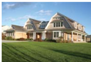
Bridgehampton. $6.695M WEB# 39981