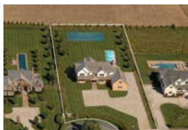
Water Mill. $4.675M WEB# 53422