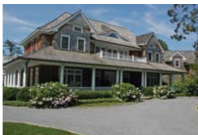
East Hampton. $7.995M WEB# 62608