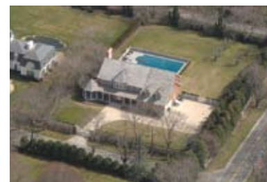
Water Mill. $4.995M WEB# 35625