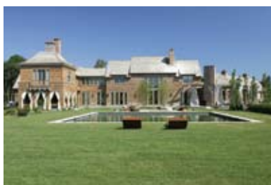
Bridgehampton. $15M WEB# 54711