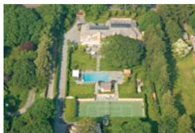
Water Mill. Price Upon Request. WEB# 34350