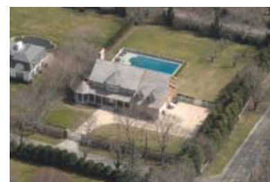
Water Mill. $4.995M. WEB# 35625