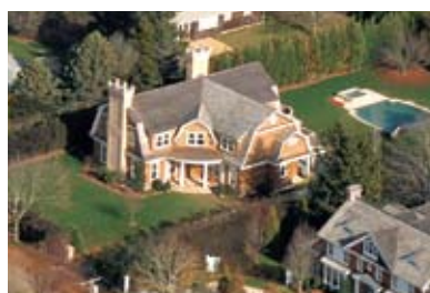
Southampton. $7.9M WEB# 49746