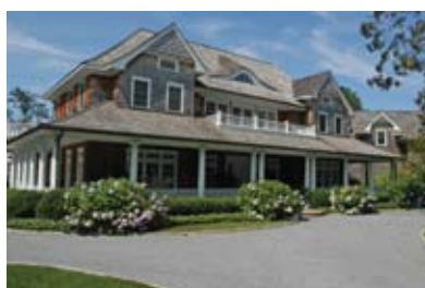
East Hampton. $7.995M WEB# 62608