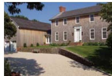
Amagansett. $3.95M WEB# 53617