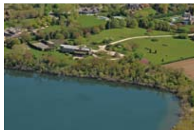
Bridgehampton. Price Upon Request. WEB# 47191