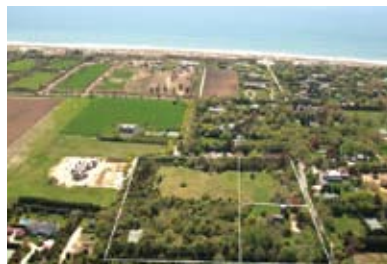
East Hampton. $21M WEB# 44738