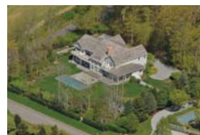
Bridgehampton. $4.15M WEB# 46401