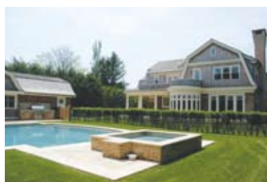
Southampton. $7.9M WEB# 49746