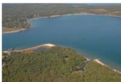
North Haven. Price Upon Request WEB# 52126