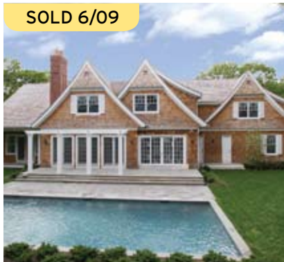
SOLD 6/09 Amagansett. $2.995M* WEB# 42038 5,500 SF, 6 bedroom, 5.5 baths, pool, 2.4 acres.