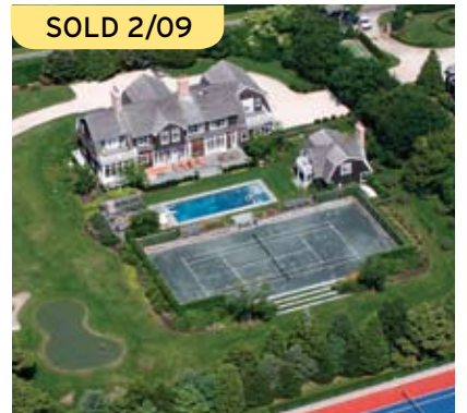
SOLD 2/09 Bridgehampton South. $9.95M* WEB# 22445 6,500 SF, 8 bedroom, pool, tennis, 1.8 acres.