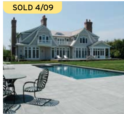
SOLD 4/09 Water Mill South. $10.25M* WEB# 52422 7,100 SF, 9 bedroom, 9.5 baths, pool, tennis, 1.4 acres.