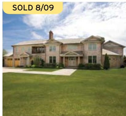
SOLD 8/09 Bridgehampton South. $6.495M* WEB# 47715 8,000 SF, 7 bedroom, 7.5 bath, pool house, 1.8 acres.