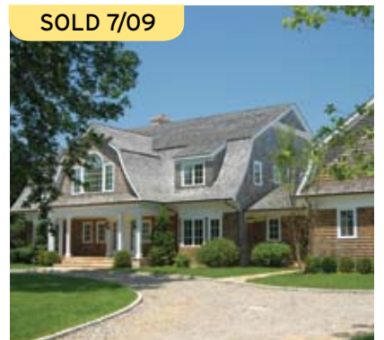
SOLD 7/09 East Hampton South. $7.95M* WEB# 47769 5,000 SF, 6 bedroom, 9 baths, pool, 1.10 acres.