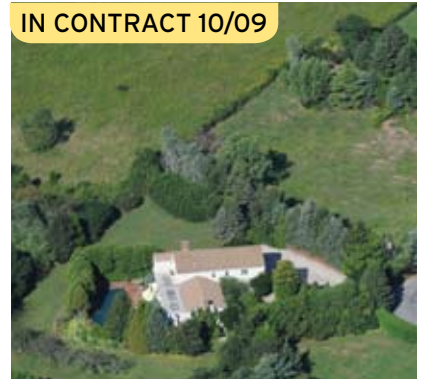
IN CONTRACT 10/09 Water Mill South. $2.595M* WEB# 39726 3,300 SF +/-, 4 bedroom, pool, 1.08 acres.