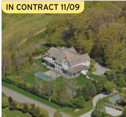
IN CONTRACT 11/09 Bridgehampton. $3.599M* WEB# 46401 5,800 SF +/-, 4 bedrooms, pool, 1.10 acres.

the weather may be getting colder, but the market is still hot