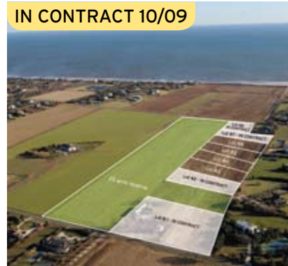
IN CONTRACT 10/09 Sagaponack South. WEB# 21047 4 available lots that can fit house, pool and court.