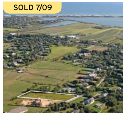
SOLD 7/09 Bridgehampton South. $3.595M* WEB# 05847 Room for a 7,000 SF house, pool and tennis, 1.4 acres.