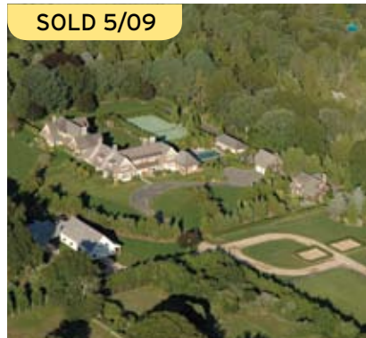
SOLD 5/09 East Hampton. $15.9M* WEB# 52610 15,000 SF, tennis, pool, barn, guest house, 8 acres.