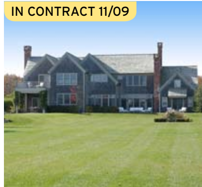
IN CONTRACT 11/09 Water Mill. $3.95M* WEB# 18749 7,000 SF +/-, 6 bedrooms, 7 bath, pool, 1.6 acres.