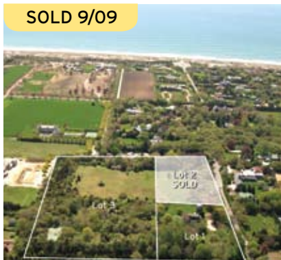
SOLD 9/09 East Hampton South. $6.3M* WEB# 06040 Room for house, pool and court, 2.7 acres.