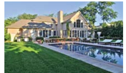
East Hampton South. $4.95M WEB# 45734 5,000 SF +/-, 5 bedrooms, 5.5 bath, pool, .75 acres.