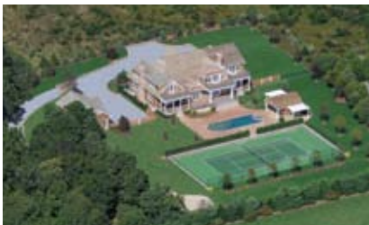
Water Mill. $5.995M WEB# 15383 7,000 SF +/-, 7 bedrooms, pool, tennis, 2.3 acres.