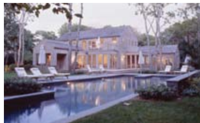
East Hampton South. $8.2M WEB# 42988 5,000 SF +/-, 5 bedrooms, pool, tennis, 1.84 acres.