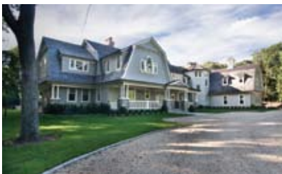
East Hampton South. $9.95M WEB# 41932 7,800 SF +/-, 8 bedrooms, pool, tennis, 1.63 acres.