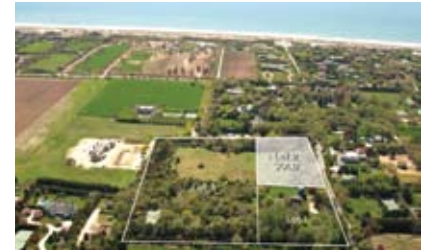
East Hampton. Price Upon Request WEB# 44738 Two available lots. 2.3 acres and 6.5 acres.