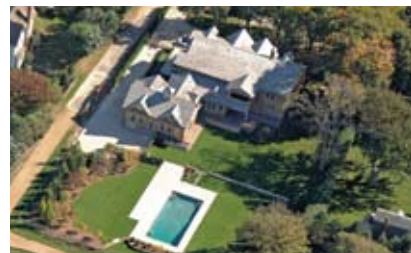
Water Mill South. $7.75M WEB# 45833 8,000 SF +/-, 7 bedrooms, 9 bath, pool, 1 acre.