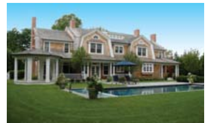
East Hampton South. $6.95M WEB# 51949 6,000 SF +/-, 6 bedrooms, pool, pool house, 1.1 acres.