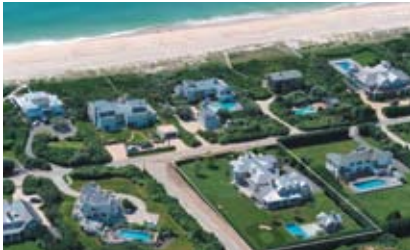
Bridgehampton South. $15.99M WEB# 33987 8,700 SF +/-, 9 bedrooms, pool, oceanviews, 1.2 acres.