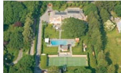
Water Mill South. $14.95M WEB# 34350 8,500 SF +/-, pool, tennis, guest house, 2 acres.