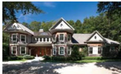
East Hampton. $4.995M WEB# 46106 6,700 SF +/-, 6 bedrooms, 7.5 bath, pool, 1.4 acres.