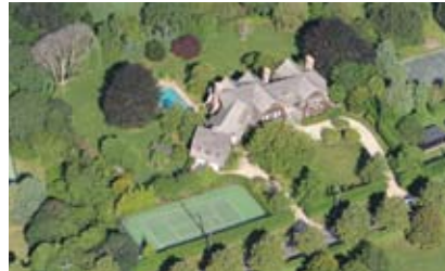
Southampton Village. $15.95M WEB# 38880 8,500 SF +/-, 7 bedrooms, pool, tennis, 1.8 acres.