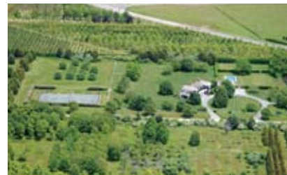
Bridgehampton. $4.995M WEB# 42555 3,500 SF +/-, 4 bedrooms, pool, tennis, 5.2 acres.