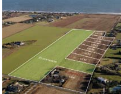
Sagaponack. Prices Upon Request, WEB# 21047 8 lots ranging from 1.4 to 2.3 acres, 40 acres total.