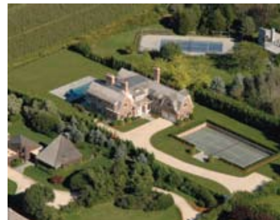
Sagaponack South. $10.95M, WEB# 54454 8,000 SF+/-, 7 bedrooms, pool, tennis, 1.7 acres.