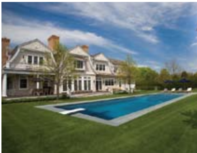
Sagaponack South. $9.7M WEB# 22357 8,000 SF+/-, 6 bedrooms, 9 bath, pool, 1.10 acres.