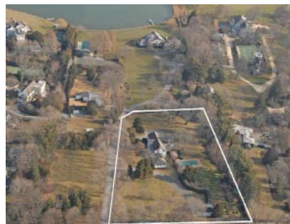
Water Mill South. $4.9M, WEB# 27759 7,800 SF+/-, 9 bdrms, 6 bath, pool, 2.2 acres.