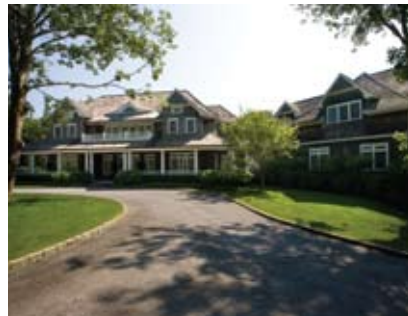
East Hampton South. $7.25M WEB# 46907 6,100 SF+/-, 6 bedrooms, 7 bath, pool, 1.13 acres.