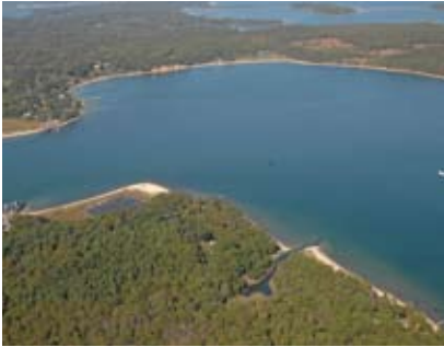
North Haven. Price Upon Request, WEB# 52126 3,000 ft. of shoreline, 3 houses, dock, 55 acres.