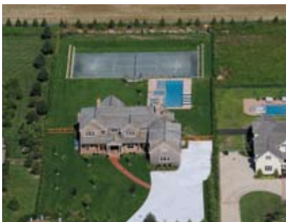
Water Mill. $4.675M, WEB# 53422 10,000 SF+/-, 10 bdrms, pool, tennis, 1.4 acres.