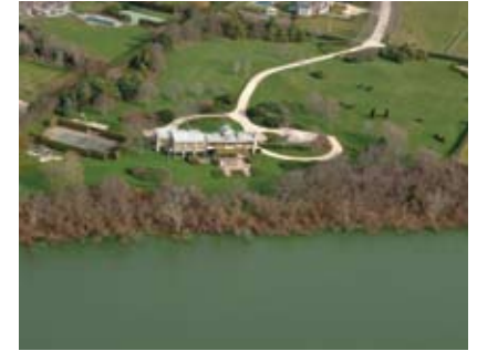
Bridgehampton South. Morgan Hill. WEB# 47191 12,000 SF+/-, pondfront, pool, tennis, 11.5 acres.