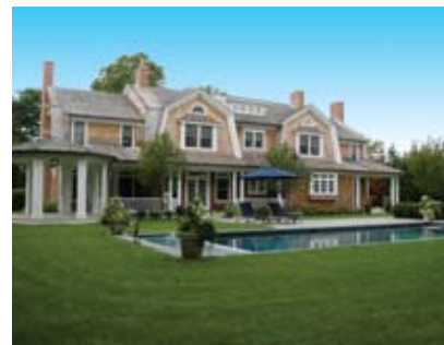
East Hampton South. $6.95M, WEB# 51949 6,000 SF+/-, 6 bdrms, 7 bath, pool, 1.10 acres.