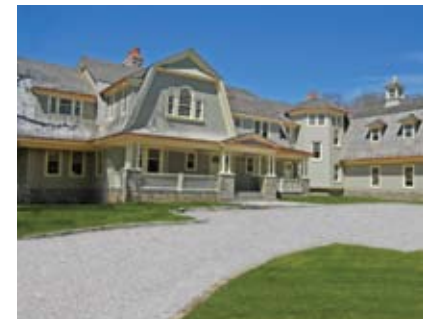
East Hampton South. $9.95M, WEB# 41932 7,800 SF+/-, 8 bedrooms, pool, tennis, 1.63 acres.