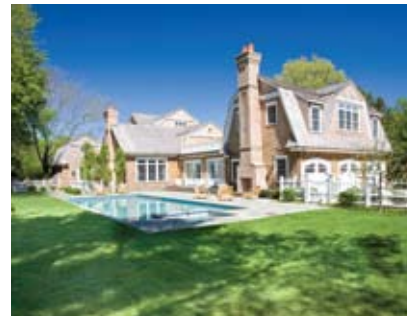
East Hampton South. $7.95M WEB# 22451 6,500 SF+/-, 6 bedrooms, 7 bath, pool, 1.20 acres.