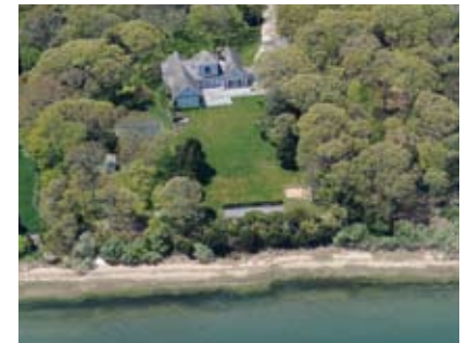
East Hampton. $7.7M WEB# 28402 3,700 SF+/-, 3 bedrooms, pool, bayfront, 2.15 acres.