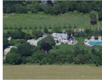
East Hampton South. $10.95M WEB# 35550 9,000 SF+/-, 5 bedrooms, pool, pool house, 2 acres.