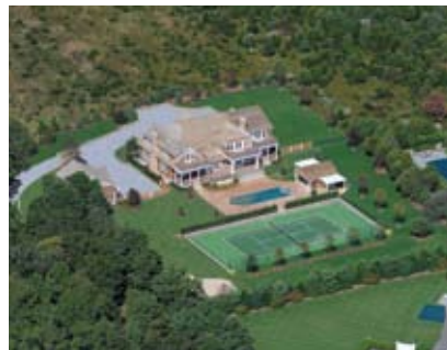
Water Mill. $5.995M, WEB# 15383 7,000 SF+/-, 7 bedrooms, pool, tennis, 2.3 acres.