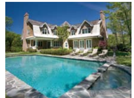
Southampton. $2.995M, WEB# 55564 6,200 SF+/-, 5 bdrms, pool, tennis, 1.20 acres.

Corcoran's Top East End Broker by Sales Volume and Rental Units for 2008 Gary DePersia, SVP, Associate Broker 516.380.0538 gdp@corcoran.com