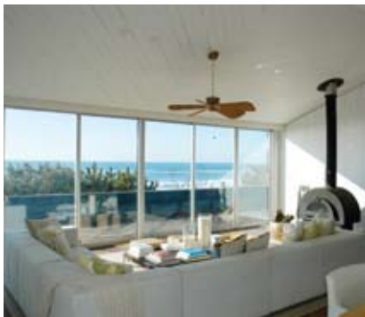
Amagansett Dunes. $6.8M WEB# 50763 3,500 SF+/-, 5 bdrms, 4 bath, oceanfront, .75 acres.