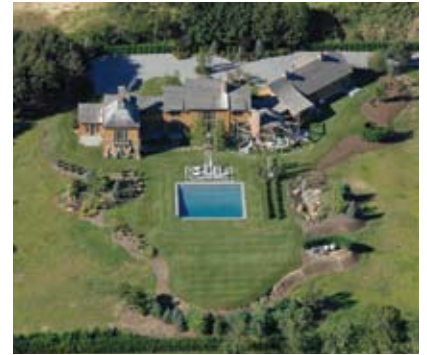
Bridgehampton South. $8.45M WEB# 54711 7,000 SF+/-, pool, room for tennis, 3.7 acres.