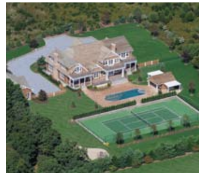
Water Mill. $5.995M WEB# 15383 7,000 SF+/-, pool, pool house, tennis, 2.3 acres.