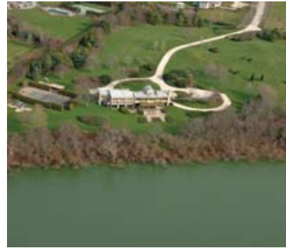
Bridgehampton South. Morgan Hill. WEB# 47191 12,000 SF+/-, pondfront, pool, tennis, 11.5 acres.