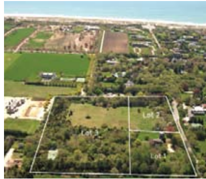
East Hampton. Prices Upon Request WEB# 44738 House, tennis, 3 separate parcels totaling 11.5 acres.