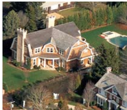
Southampton Village. $6.25M WEB# 49746 8,000 SF+/-, pool, pool house, finished basement.