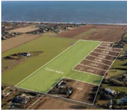
Sagaponack. Price Upon Request WEB# 21047 8 lots ranging from 1.4 to 2.3 acres, 40 acres total.