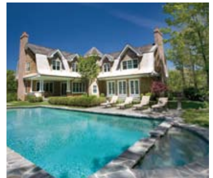
Southampton. $2.995M WEB# 55564 6,200 SF+/-, 5 bedrooms, pool, tennis, 1.2 acres.