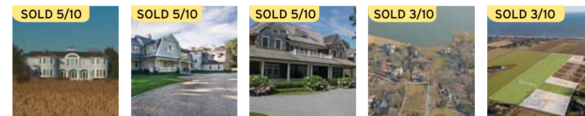
Water Mill $7.995M*