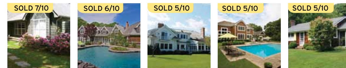
East Hampton $799K*