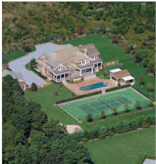
Water Mill. $5.575M WEB# 15383 7,000 SF+/-, 7 bedrooms, 7.5 baths, pool, tennis, 2.1 acres.