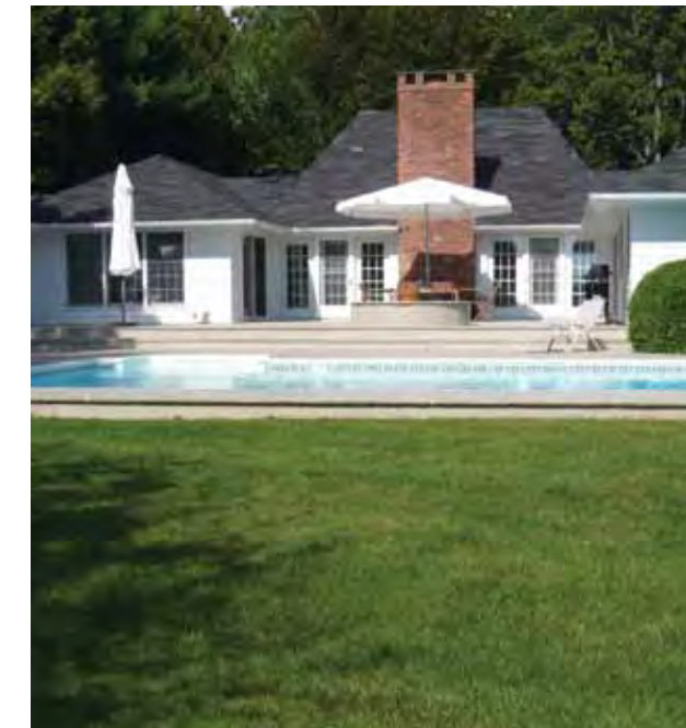
East Hampton. $3.25M WEB# 29323 2,500 SF+/-, 4 bedrooms, 3 bath, pool, reserve, 4 acres.