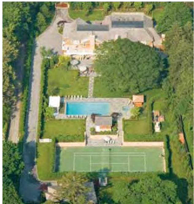
Water Mill South. Price Upon Request. WEB# 34350 8,500 SF+/-, guest house, gunite pool, tennis, 2 acres.