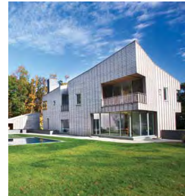
Shelter Island. $4.195M WEB# 43801 6,000 SF+/-, 6 bedrooms, 5.5 baths, pool, guest house, 1 acre.