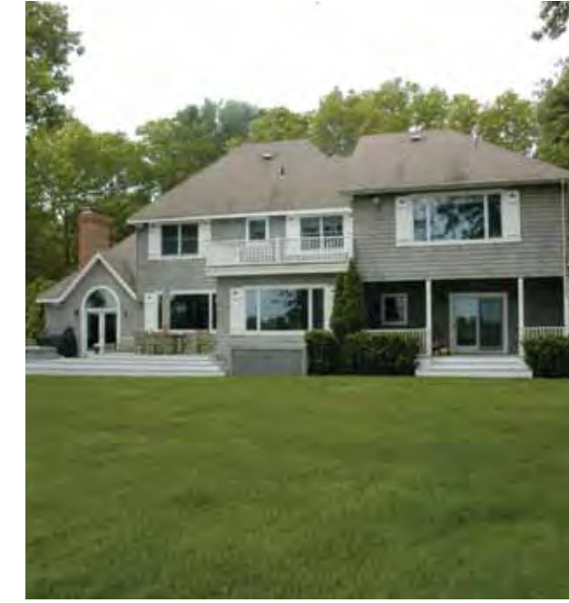
Water Mill. $2.295M WEB# 11985 5,100 SF+/-, 5 bedrooms, 3.5 bath, pool, reserve, 1.66 acres.