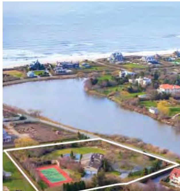
Southampton Village. $9.75M WEB# 32990 6,500 SF+/-, 6 bedrooms, 6.5 baths, pool, tennis, 2 acres.