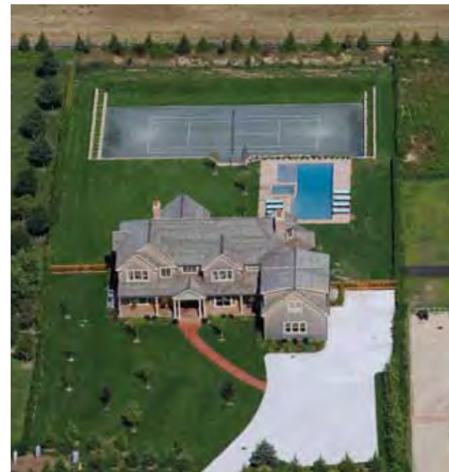
Water Mill. $4.675M. WEB# 53422 10,000 SF+/-, 10 bedrooms, gunite pool, tennis, 1.4 acres.