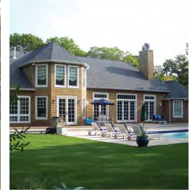
East Hampton. $1.995M WEB# 44423 4,500 SF+/-, 4 bedrooms, 5.5 bath, pool, 1.3 acres.