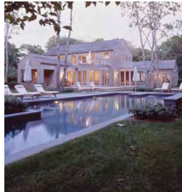
East Hampton South. $7.5M WEB# 42988 5,000 SF+/-, 5 bedrooms, 7 baths, pool, tennis, 1.84 acres.