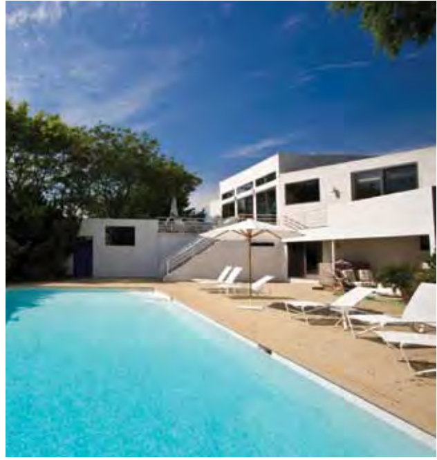
Sagaponack South. $4.995M. WEB# 40344 3,600 SF+/-, 4 bedrooms, 3.5 baths, gunite pool, 1.5 acres.