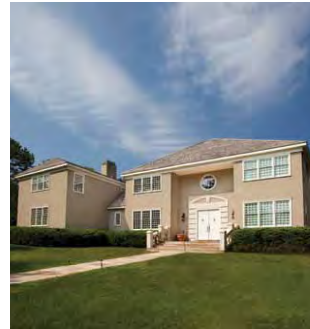
Water Mill. $3.5M WEB# 27954 7,800 SF+/-, 7 bedrooms, pool, tennis, guest house, 5 acres.