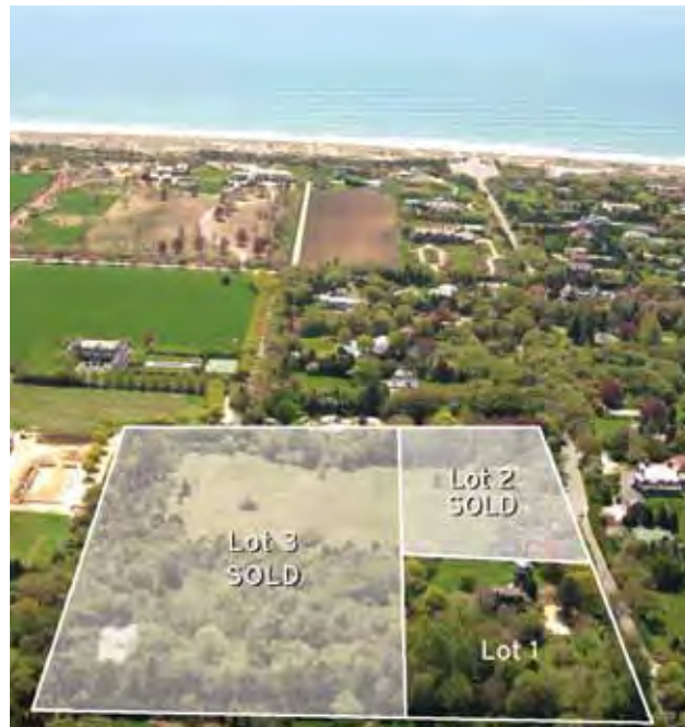
East Hampton South. $5.95M WEB# 24677 2,500 SF+/-, 5 bedrooms, 4.5 baths, room for pool, 2.3 acres.