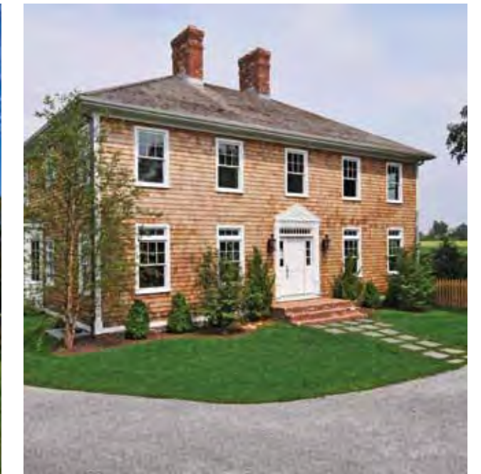
Water Mill South. $3.5M WEB# 28996 4,500 SF+/-, 6 bedrooms, 6.5 baths, pool, .70 acre.