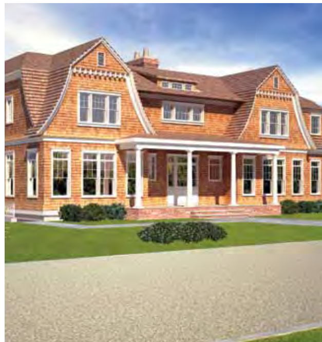
Wainscott South. $4.75M WEB# 43803 6,300 SF+/-, 6 bedrooms, 7.5 baths, pool, 1.2 acres.