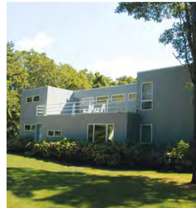
Wainscott. $1.995M WEB# 44598 3,400 SF+/-, 6 bedrooms, 4.5 bath, pool, 1.10 acres.