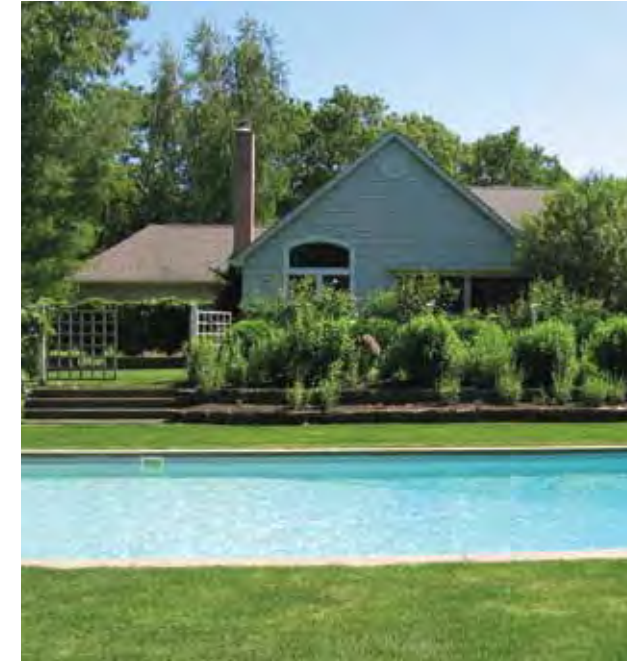
East Hampton. $2.295M WEB# 52387 3,500 SF+/-, 4 bedrooms, 3.5 bath, pool, 3 acres.