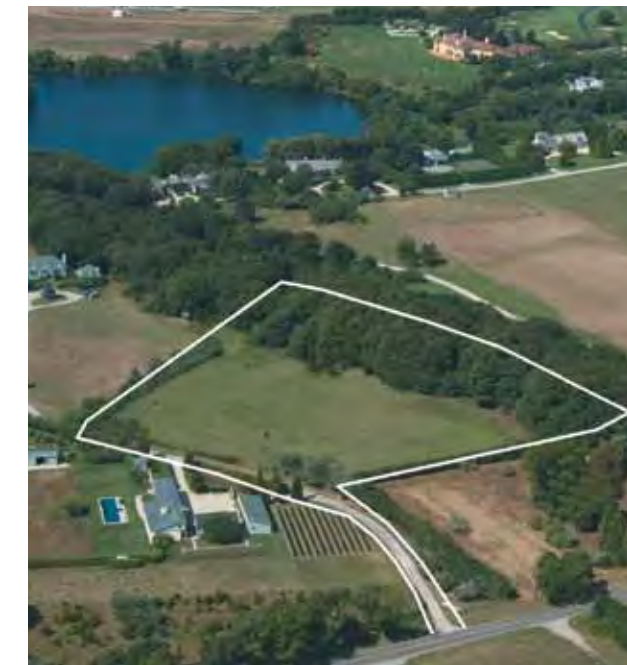
Bridgehampton. $3.995M WEB# 00806 room for 12,000 house, pool and tennis, 5.5 acres.