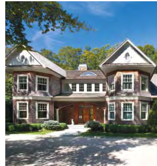
East Hampton. $4.595M. WEB# 46106 6,700 SF+/-, 6 bedrooms, 7.5 baths, gunite pool, 1.4 acres.