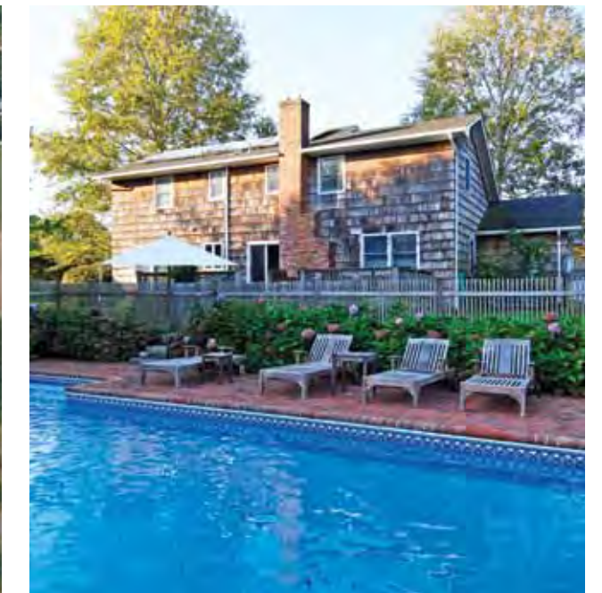
Bridgehampton. $995K WEB# 52886 2,400 SF+/-, 4 bedrooms, 2.5 bath, pool, .92 acres.

Gary DePersia, SVP, Associate Broker, 516.380.0538, gdp@corcoran.com