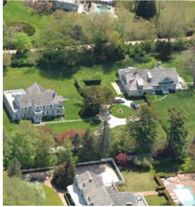
East Hampton South. $4.995M WEB# 10032 6,000 SF+/-, 6 bedrooms, guest house, pool, 2.75 acres.