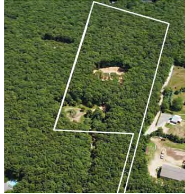
Sagaponack. $1.050M. WEB# 02682 room for large house, pool, pool house and court. 6.6 acres.