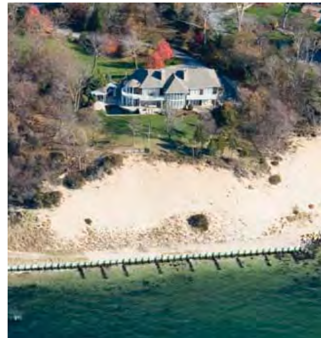
North Haven. $8.495M WEB# 29701 6,100 SF+/-, 6 bedrooms, 5.5 baths, pool, bayviews, 2.6 acres.