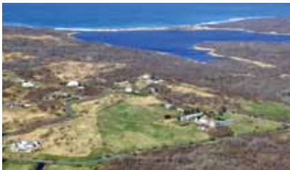
Montauk 2 lots plus reserve, ocean views, 13 acres. Exclusive $9.2M WEB# 28118