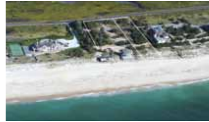
East Quogue Room for house, pool, tennis, 2.2 acres. Co-Exclusive $8.95M WEB# 07102