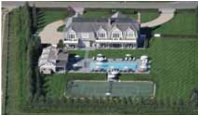
Water Mill 11,000 SF+/-, 10 bedrooms, pool, 2.5 acres. Exclusive $12.95M WEB# 37279