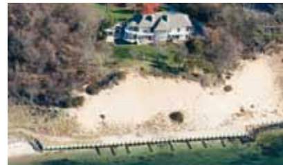
North Haven 6,100 SF+/-, 6 bedrooms, pool, 2.6 acres. Exclusive $7.95M WEB# 29701