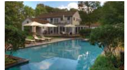
East Hampton 5,000 SF+/-, tennis, pool, 1.84 acres. Co-Exclusive $7.5M WEB# 42988