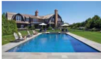
Water Mill 6,300 SF+/-, 7 bedrooms, pool, 2.8 acres Co-Exclusive $8.25M WEB# 45845