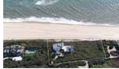
Wainscott 3,000 SF+/-, pool, oceanfront, 2.3 acres. Exclusive, Price On Request WEB# 55212