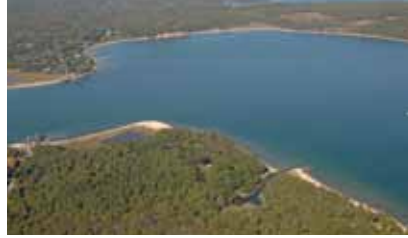
North Haven Houses, docks, bay front, 55 acres. Co-Exclusive $44.99M WEB# 52126