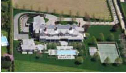
Bridgehampton 31,000 SF+/-, reserve, tennis, 11.5 acres. Co-Exclusive $49.5M WEB# 32012