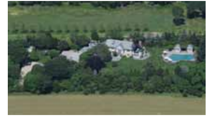
Amagansett 9,000 SF+/-, 5 bedrooms, pool, 2 acres. Exclusive $9.25M WEB# 35550