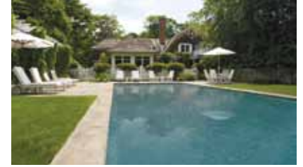
East Hampton 11,600 SF+/-, 8 bedrooms, pool, 3.6 acres. Exclusive $17.9M WEB# 37379