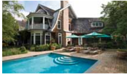
Southampton 8,500 SF+/-, pool, tennis, 1.8 acres. Exclusive $13.95M WEB# 38880