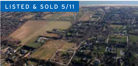
East Hampton. $5.95M*