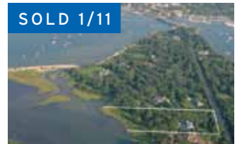
Sag Harbor. $7.9M*