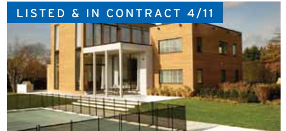
Water Mill. $5.495M*