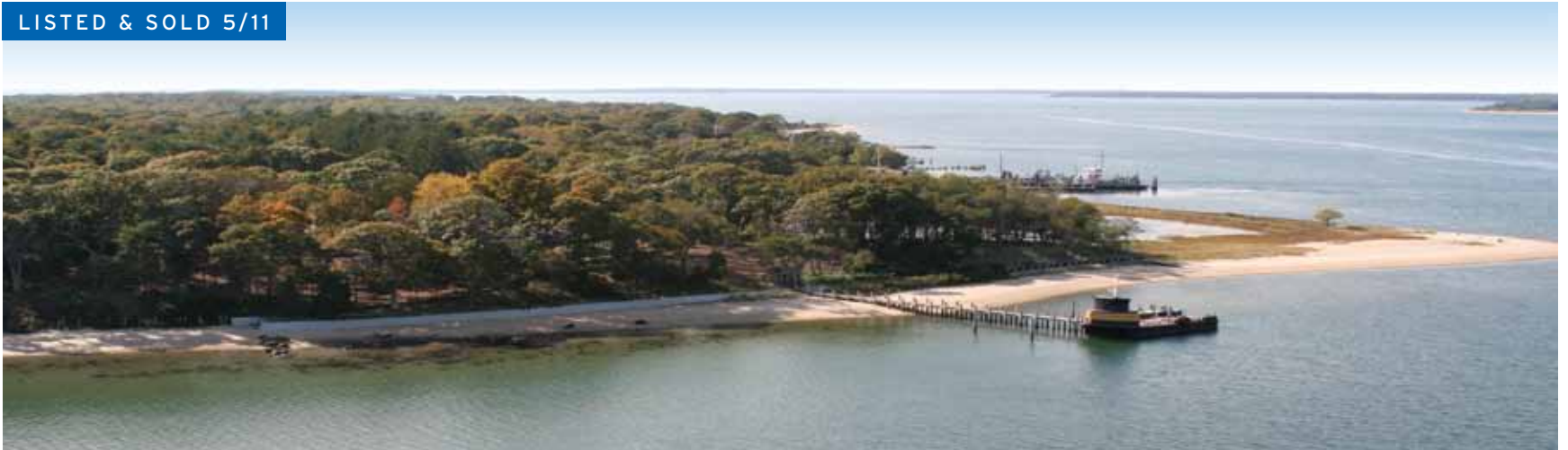
Tyndal Point. $44.99M*