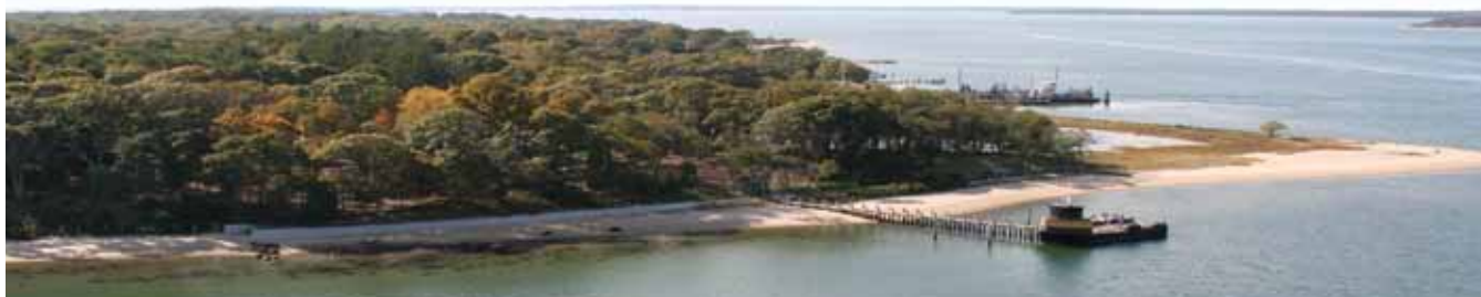
Tyndal Point. $44.99M*