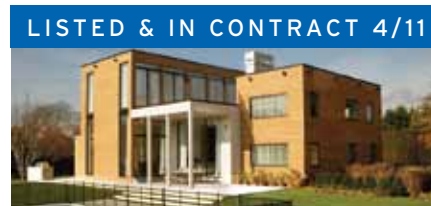
Water Mill. $5.495M*