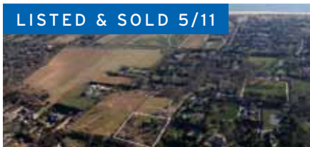
East Hampton. $5.95M*