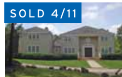
Water Mill. $3.15M*