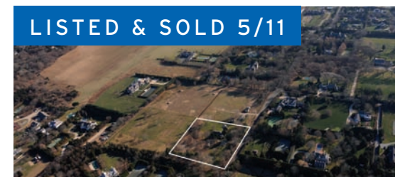
East Hampton. $5.95M*