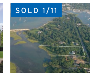
Sag Harbor. $7.9M*

Over $95M Sold & Closed in the first 7 months of 2011