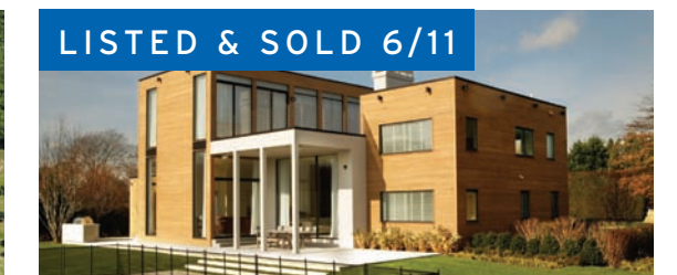
Water Mill. $5.495M*