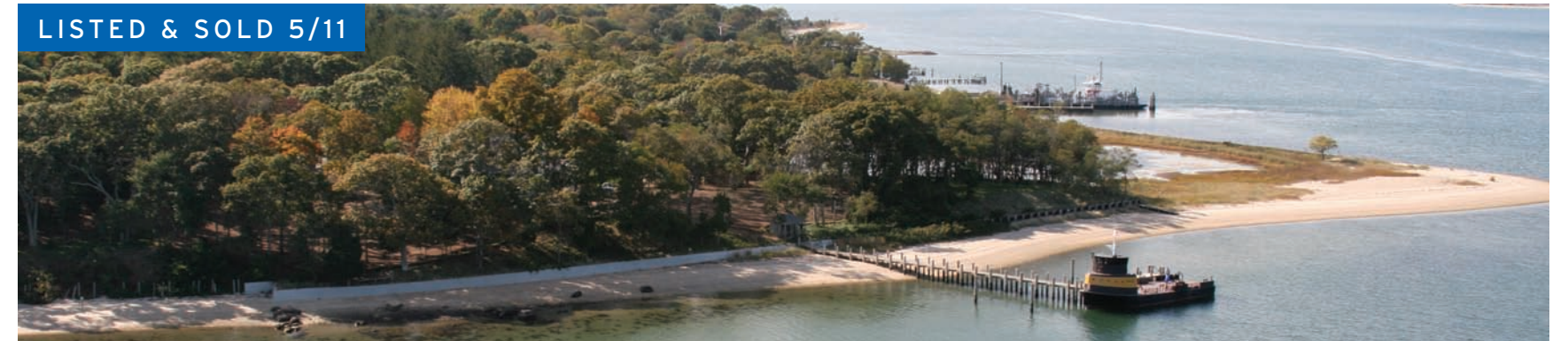
Tyndal Point. $44.99M*

"I believe in my listings...apparently my buyers do too."