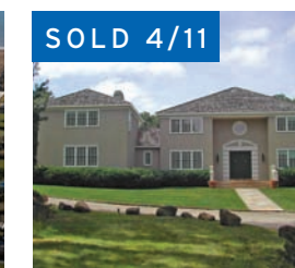
Water Mill. $3.15M*