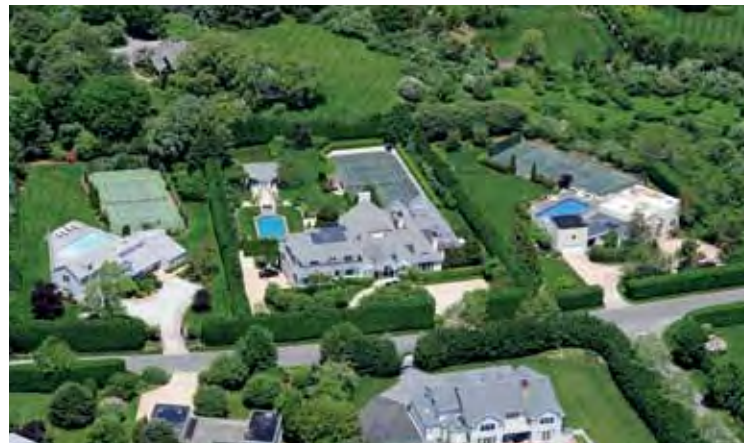
Resort at Mill Creek