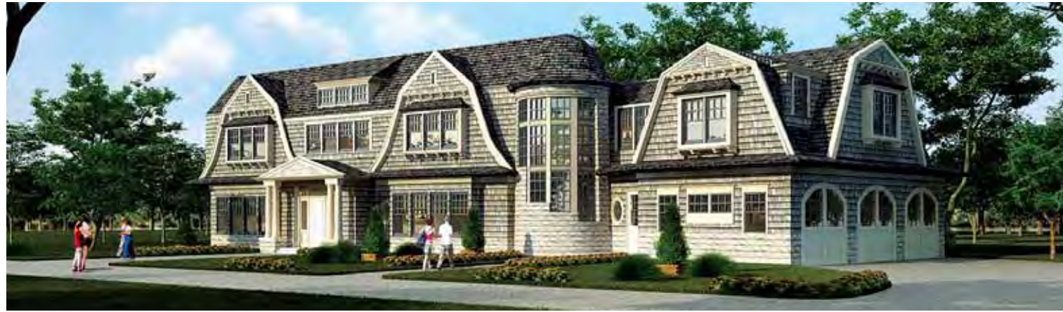
Sagaponack: America's #1 Zip Code