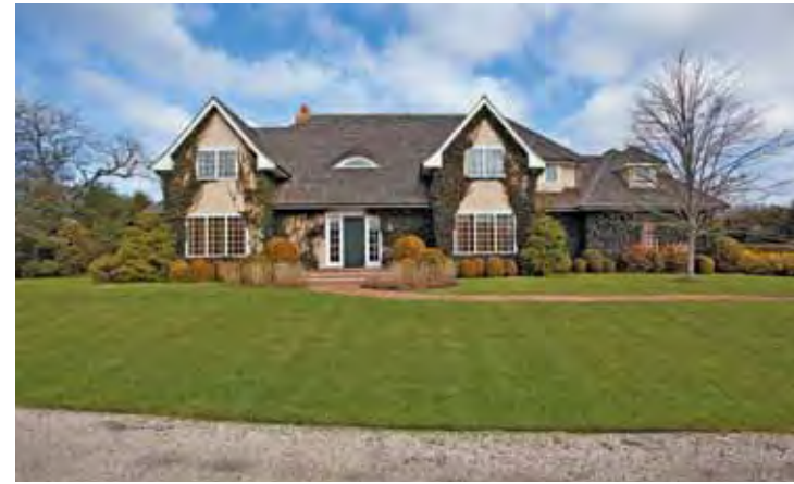
English Country in Southampton Village