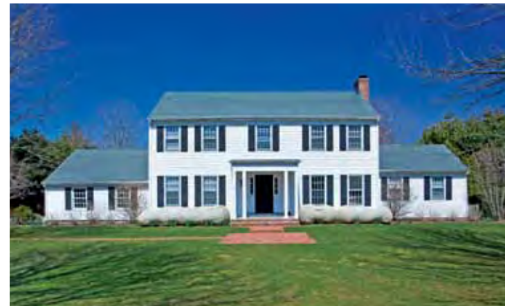
On the Lanes