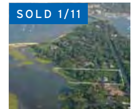
Water Mill. $3.15M*