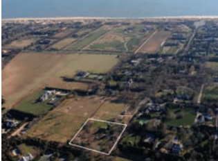
East Hampton. $5.95M*