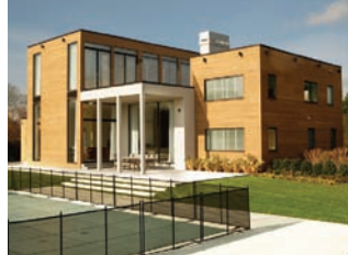
Water Mill. $5.495M*