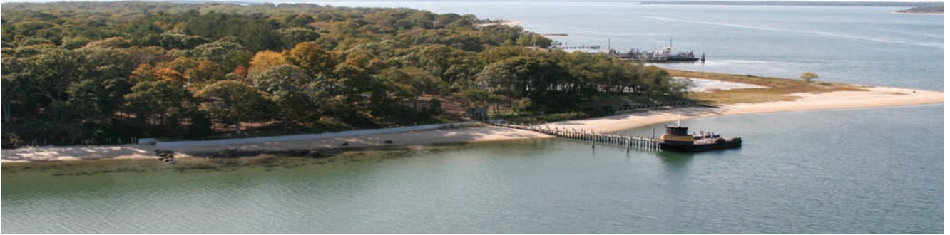
Tyndal Point. $44.99M*