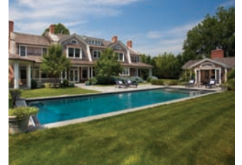
East Hampton. $6.295M*