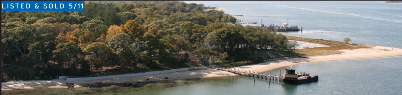
Tyndal Point. $44.99M* Top Sale In 2011