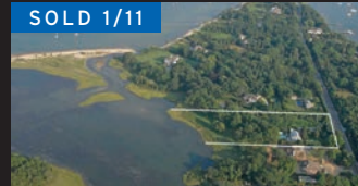
Sag Harbor. $7.9M*