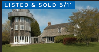
East Hampton. $5.95M*