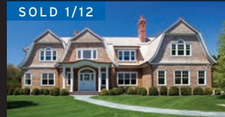
East Hampton. $7.25M*