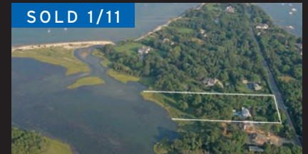
Sag Harbor. $7.9M*