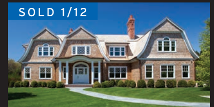
East Hampton. $7.25M*