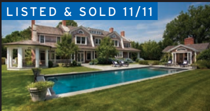
East Hampton. $6.295M*