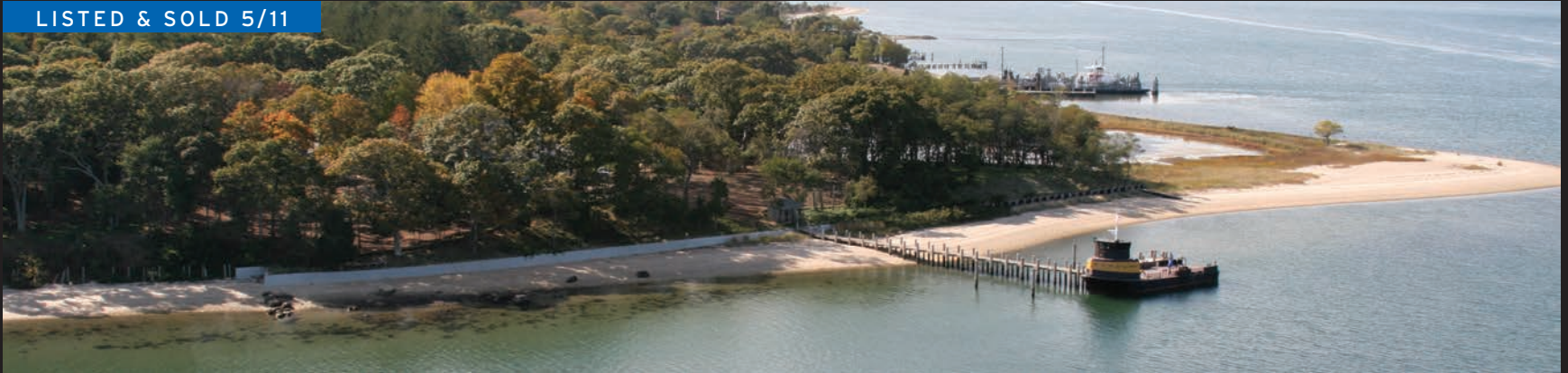
Tyndal Point. $44.99M* Top Sale In 2011