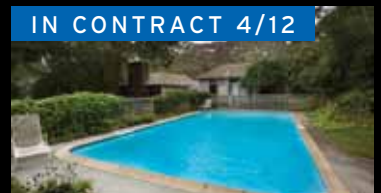
East Hampton. $2.895M*