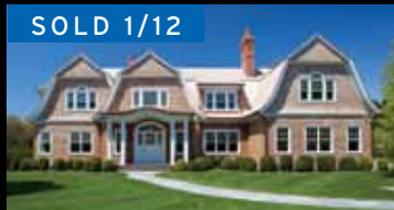
East Hampton. $7.25M*