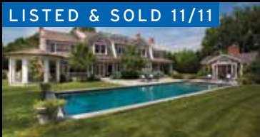
East Hampton. $6.295M*