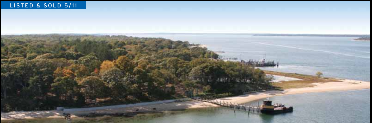
Tyndal Point. $44.99M* Top Sale In 2011