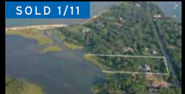
Sag Harbor. $7.9M*