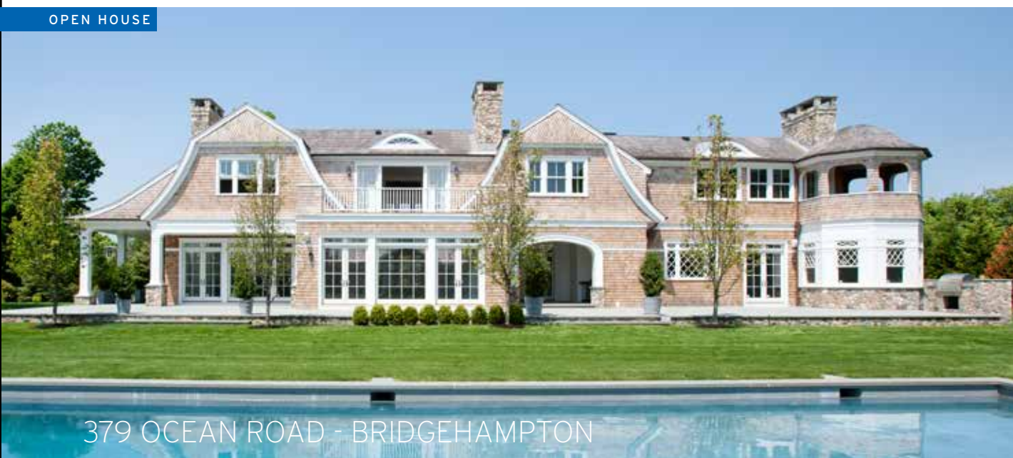
379 OCEAN ROAD - BRIDGEHAMPTON