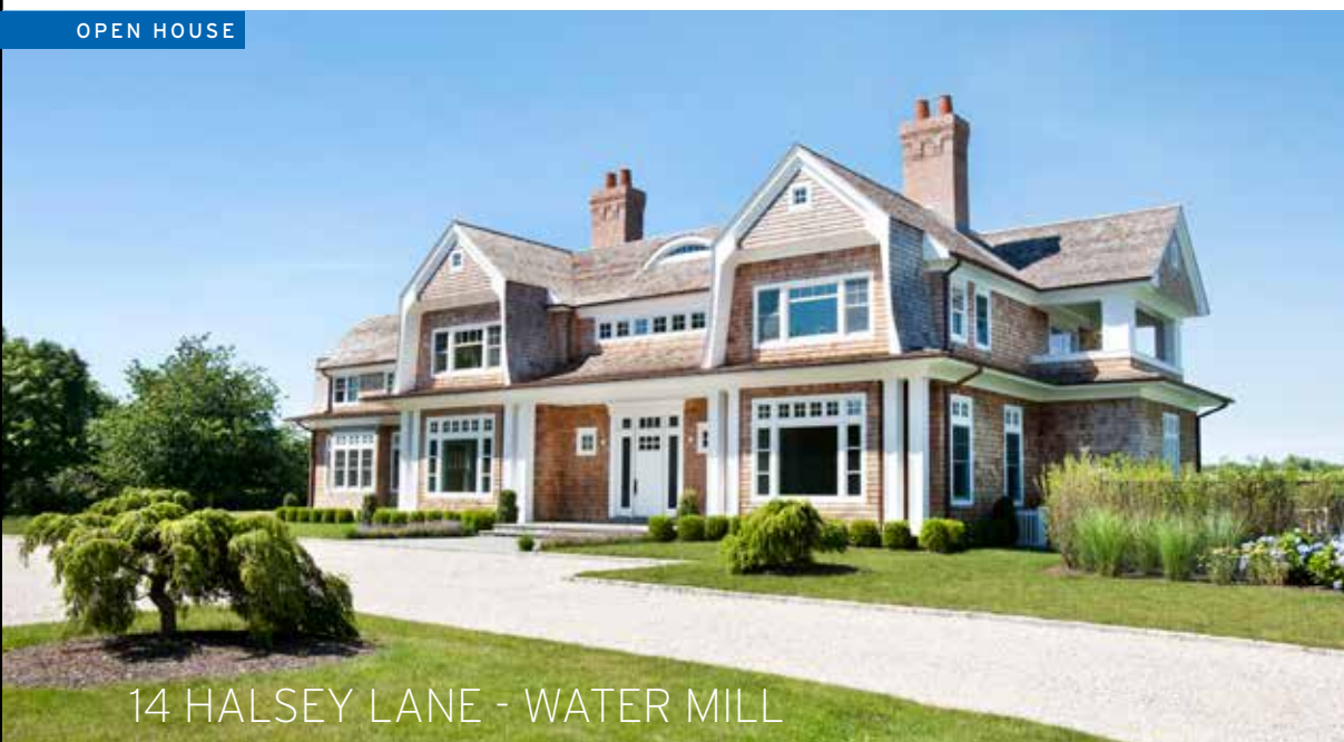
14 HALSEY LANE - WATER MILL