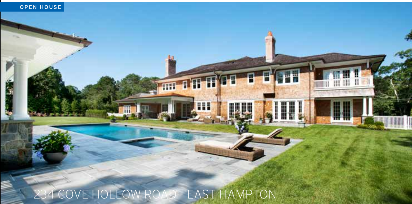
234 COVE HOLLOW ROAD - EAST HAMPTON

East Hampton. M & M Custom Homes returns to East Hampton South as construction is now complete in picturesque seclusion on 1.25 acres in the coveted enclave that is Georgia. This 6,300 SF +/-, 8 bedroom traditional, with new interiors by Gail Sitomer, offers, on the 1st floor, great room, den and family room connecting to the fully outfitted kitchen, all warmed by fireplaces. A formal dining room bolstered by butlers pantry, generous guest master suite, a pair of powder rooms and covered porch complete the first floor. Upstairs the expansive master wing runs from the front to the back of the residence offering luxurious bath with steam shower and heated floors, his and her closets and a cozy sitting room. Four additional, well placed ensuite bedrooms accommodate weekend entertaining. There is also unfinished attic space that awaits the fertile imagination. The finished lower level adds nearly 3,000 SF +/- and is complete with a media room, prewired for your own home theatre, as well as wine cellar, gym with full spa bath, recreational rooms and a pair of staff suites sharing another full bath. Outside a built-in kitchen can be found on the broad covered porch while a cabana overlooks the 20' X 50' pool, spa and a rare 4-car detached garage. All this, set within a sea of verdant lawn behind dense perimeter plantings, just a short distance to village shopping and ocean beaches. Make your appointment for a personal preview today.