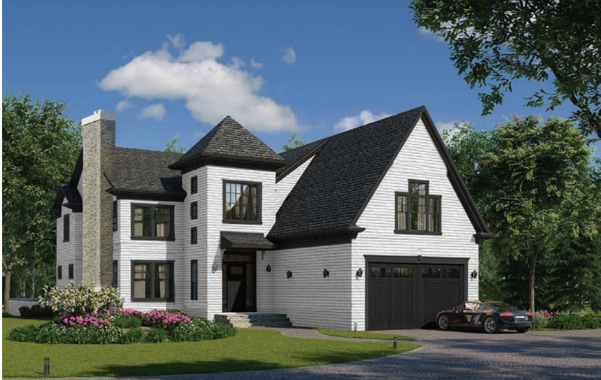
18 SELLENTIN WAY