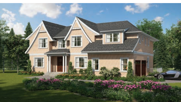
14 SELLENTIN WAY