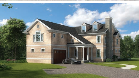
16 SELLENTIN WAY