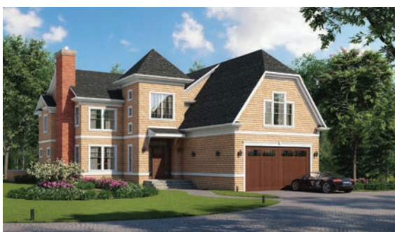
12 SELLENTIN WAY