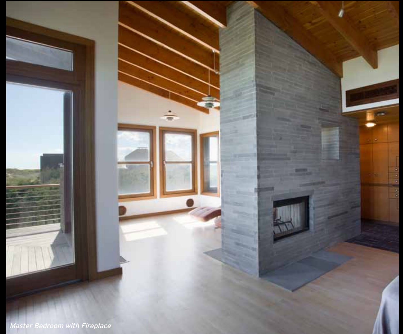
Master Bedroom with Fireplace