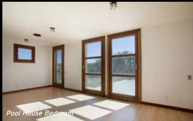
Pool House Bedroom