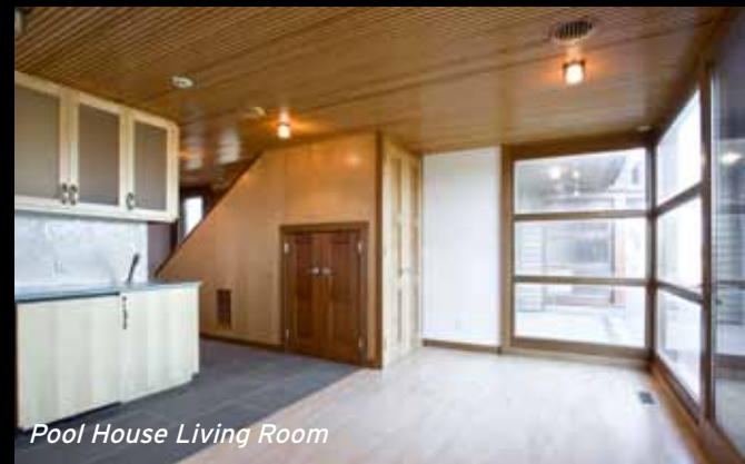
Pool House Living Room