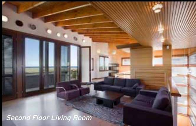
Second Floor Living Room