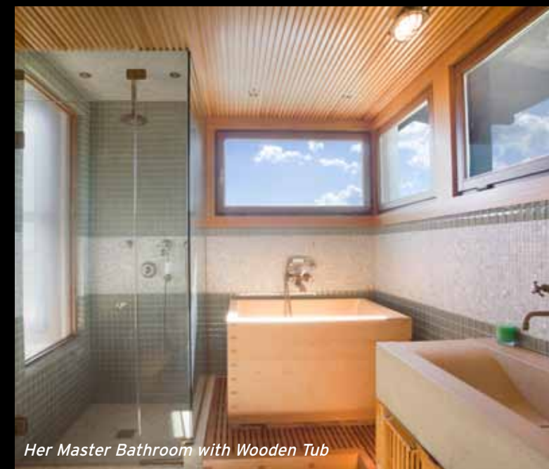
Her Master Bathroom with Wooden Tub