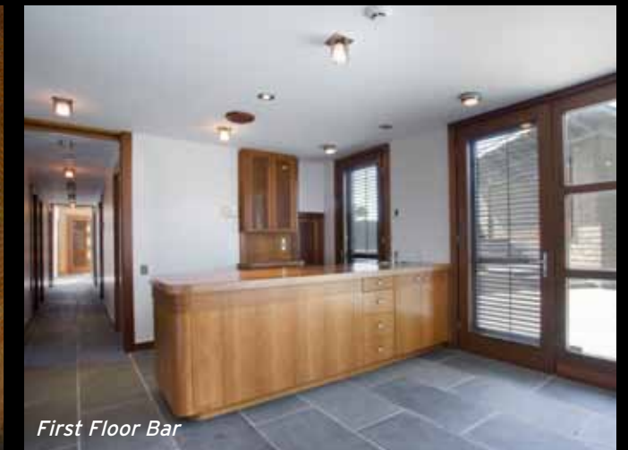
First Floor Bar