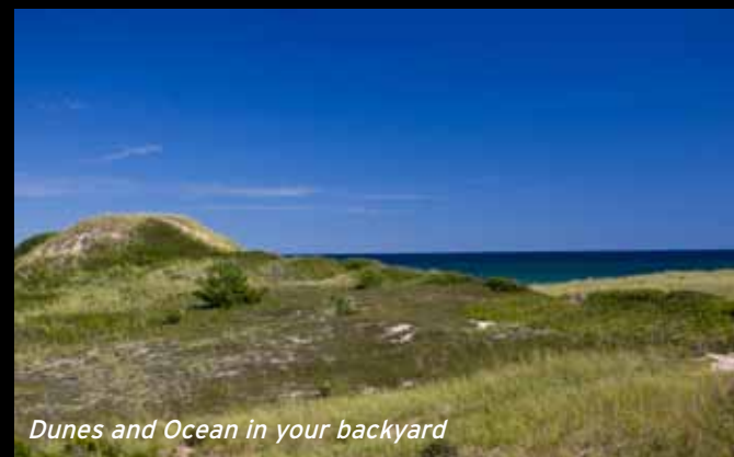
Dunes and Ocean in your backyard