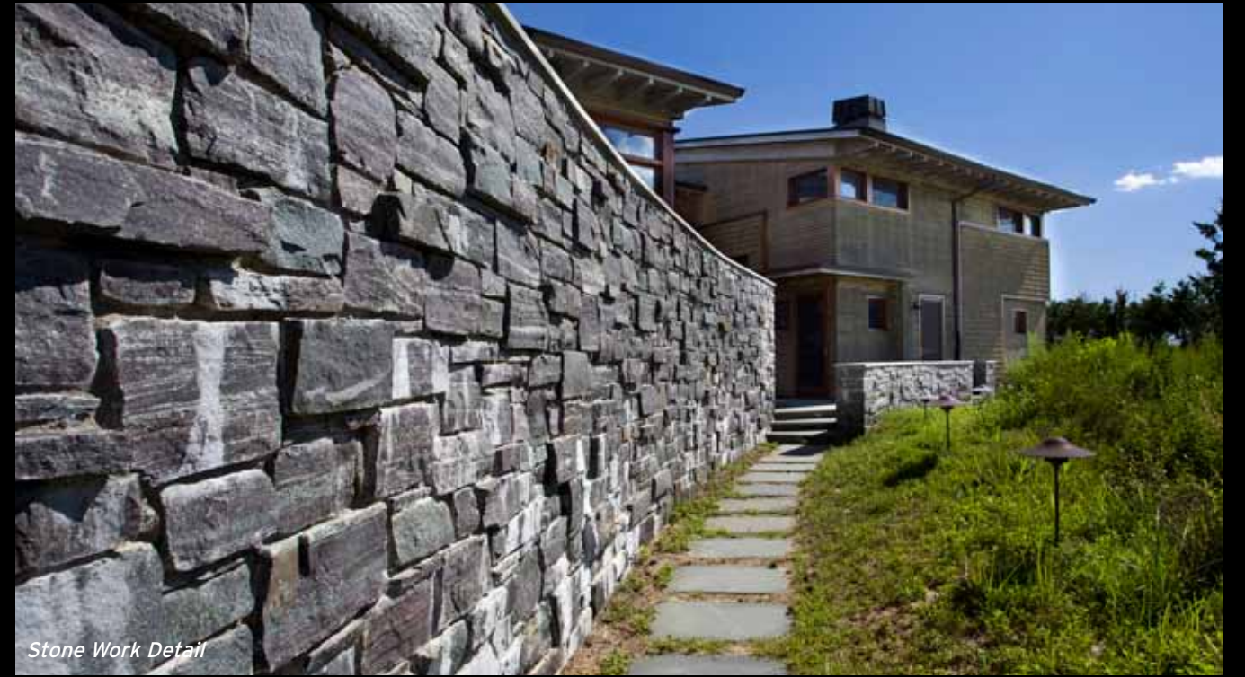
Stone Work Detail