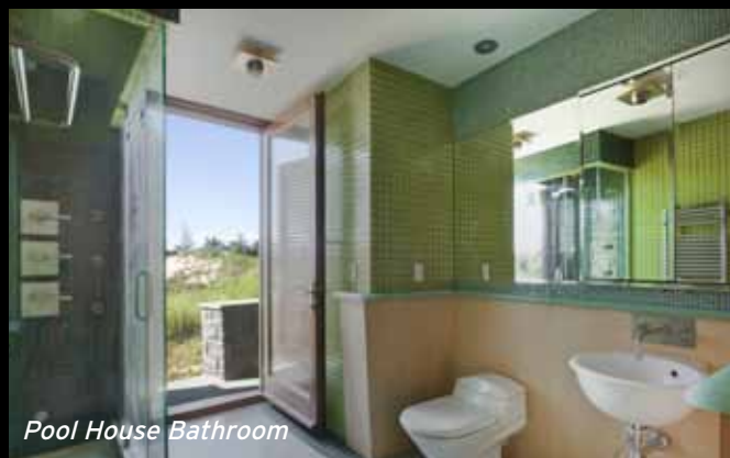
Pool House Bathroom