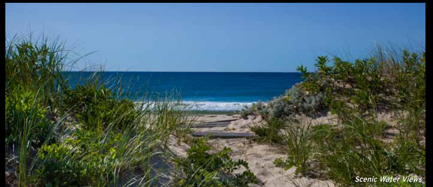
Scenic Water Views