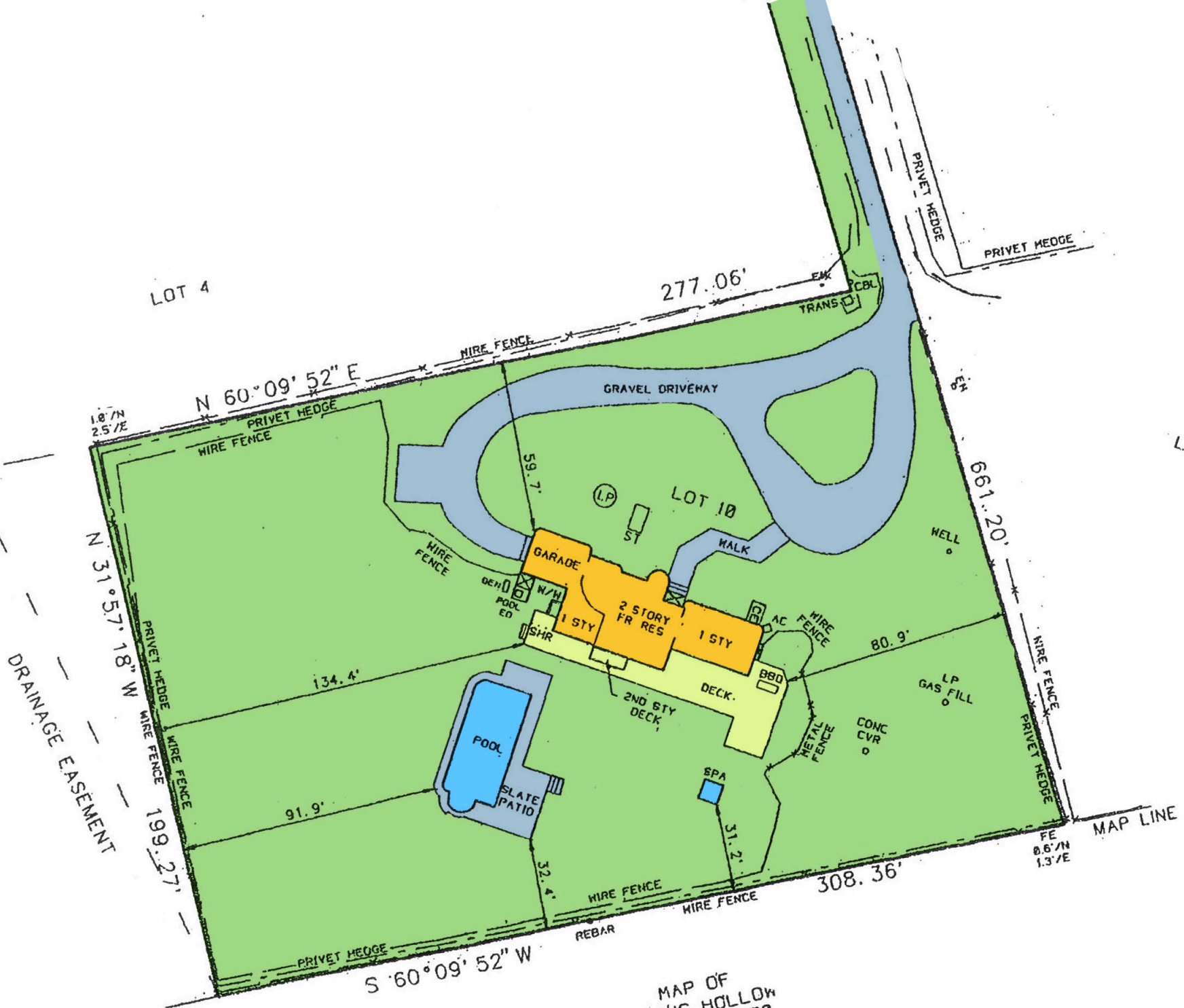
MAP OF SPRING HOLLOW FILE NO. 6700