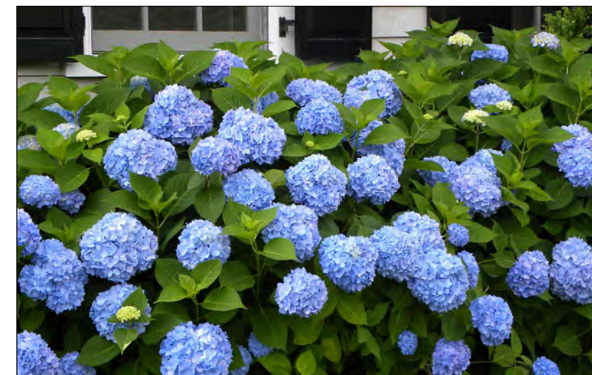
'ENDLESS SUMMER' HYDRANGEA