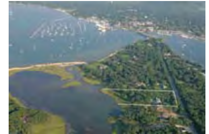
Sag Harbor. $9.95M WEB# 11323