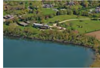
Bridgehampton. Morgan Hill Farm. WEB# 47191