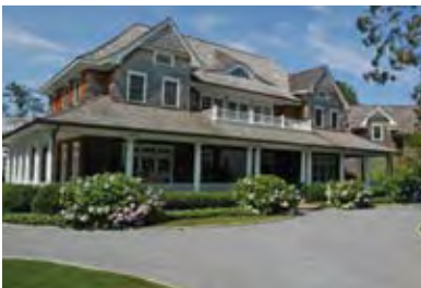
East Hampton. $7.25M WEB# 62608