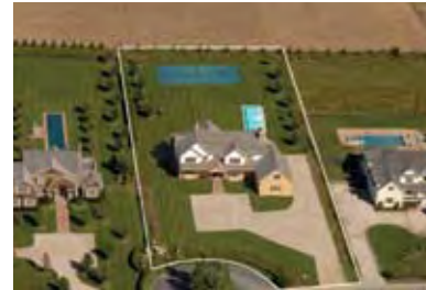
Water Mill. $4.675M WEB# 53422