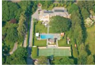
Water Mill. Price Upon Request. WEB# 34350