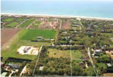
East Hampton. Price Upon Request. WEB# 44738