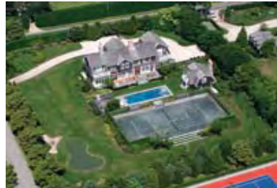
Bridgehampton. $9.95M WEB# 22445