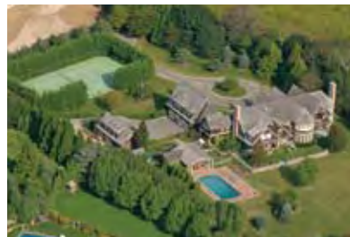
East Hampton. Price Upon Request. WEB# 47839