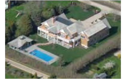
Sagaponack. $8.495M WEB# 44758