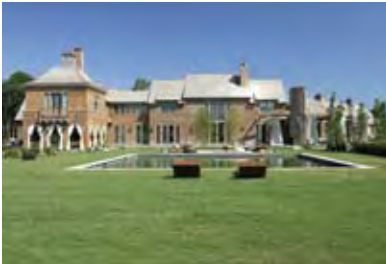
Bridgehampton. $12.9M WEB# 54711