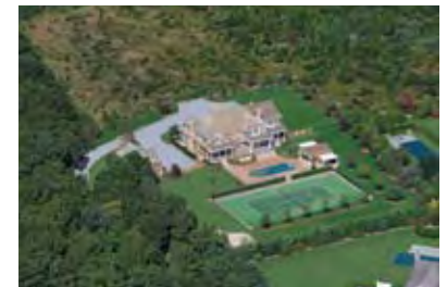
Water Mill. $6.995M WEB# 15383