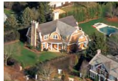
Southampton. $6.85M WEB# 49746