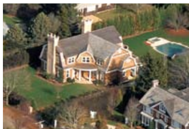
Southampton. $7.9M WEB# 49746