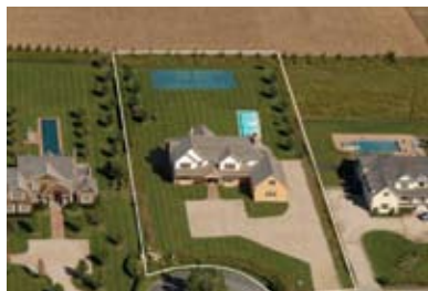
Water Mill. $4.675M WEB# 53422