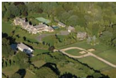
East Hampton. Price Upon Request. WEB# 52610