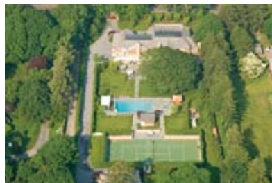
Water Mill. Price Upon Request. WEB# 34350