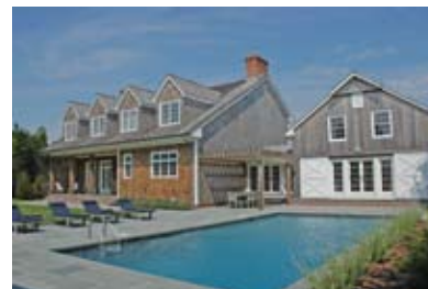
Amagansett. $3.95M WEB# 53617