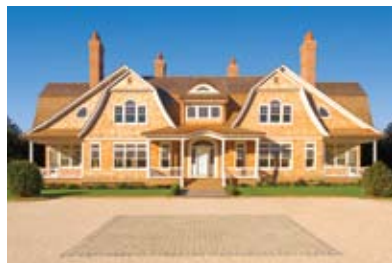
Water Mill. $11.495M WEB# 52422