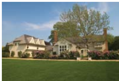
East Hampton. $14.995M WEB# 13436