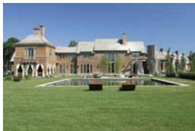
Bridgehampton. $15M WEB# 54711