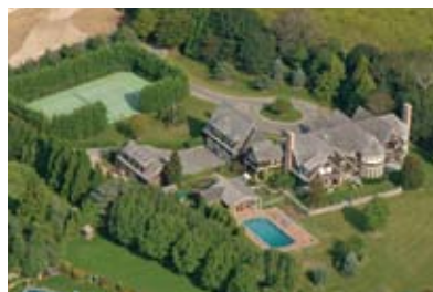
East Hampton. Price Upon Request. WEB# 47839