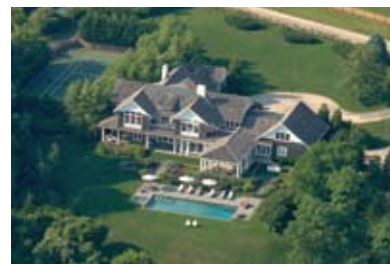
Bridgehampton. Price Upon Request. WEB# 76298