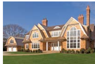
East Hampton. $11.45M WEB# 52844