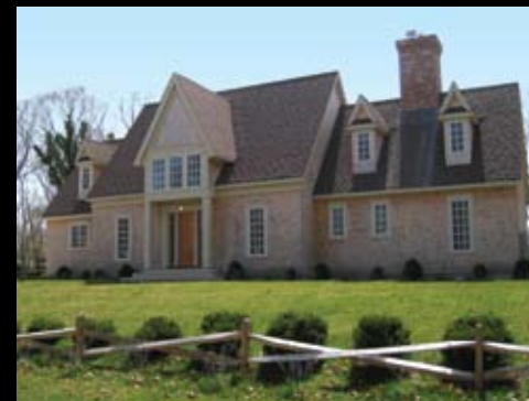
Sag Harbor. Waterfront Community. WEB# 49488 3,800 sq. ft., 4 bedrooms, 5 baths, pool, deeded beach access.