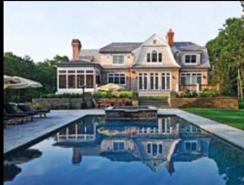
Amagansett. Devon Area Traditional. WEB# 22447 7,000 sq. ft., 5 bedroom, 7 bath, finished basement, 2.25 acres.

North of the Highway...South of the Highway