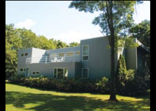
Wainscott. Classic Beach House. WEB# 44598 3,500 sq. ft., 6 bedroom, 4.5 baths, pool, bike to beach.