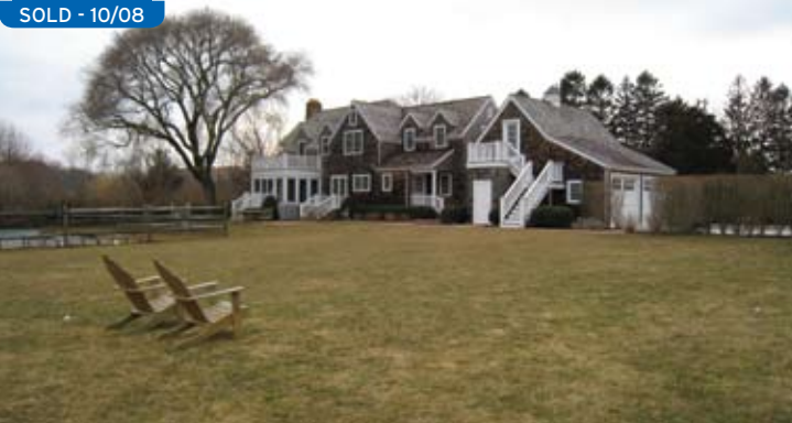
Water Mill. $2.595M WEB# 31741