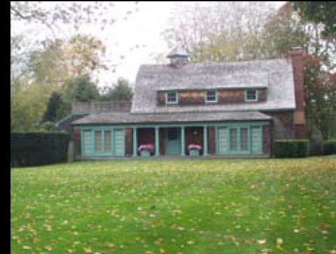
East Hampton. Georgica Carriage House. WEB# 14589 3,500 sq. ft., 4 bedrooms, 3.5 baths, pool, 1.4 acres.