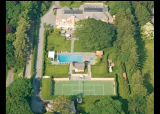
Water Mill. Cobb Road Compound. WEB# 34350 11,000 sq. ft., 7 bedrooms, guest house, tennis, 2 acres.