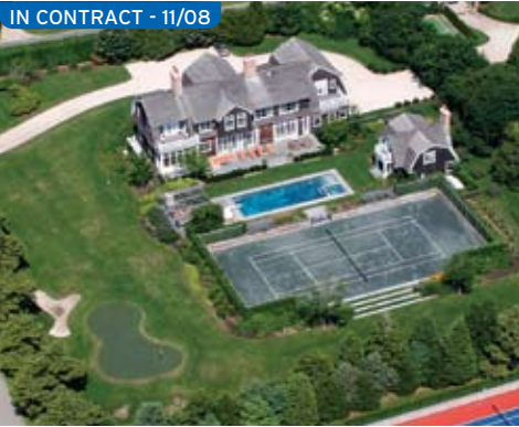
Bridgehampton. $9.95M WEB# 22445