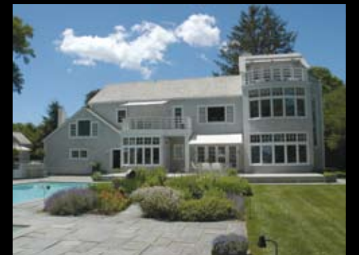
North Haven. Waterfront Compound. WEB# 11323 House, pool, pool house on 1.5 acres. Contiguous 2.3 acre lot.

Exceptional Properties.....Exceptional Results