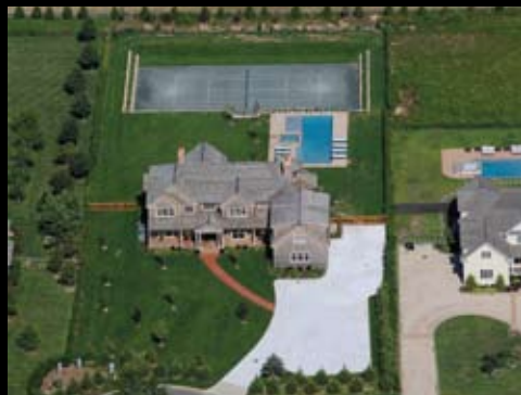
Water Mill. Reserved For You. WEB# 53422 6,800 sq. ft., 10 bedroom, finished basement, tennis, 1.5 acres.