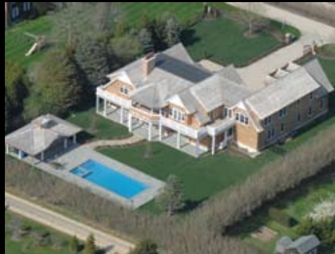
Sagaponack. Big, Bold, Beautiful. WEB# 44758 12,000 sq. ft., 8 bedrooms, 11.5 baths, finished basement.