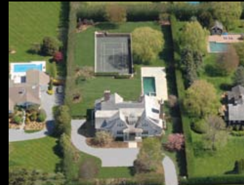
Water Mill. Mecox Area Estate. WEB# 52422 7,100 sq. ft., 9 bedrooms, 9.5 bath, pool, tennis, 1.4 acres.