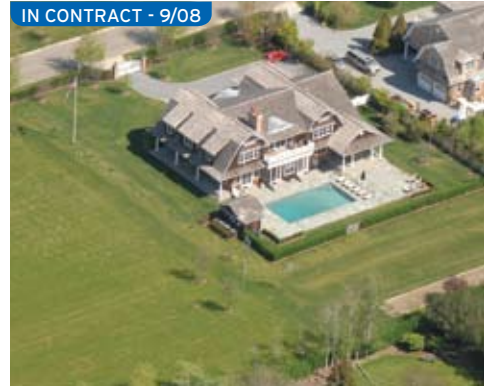
Bridgehampton. $6.695M WEB# 39981