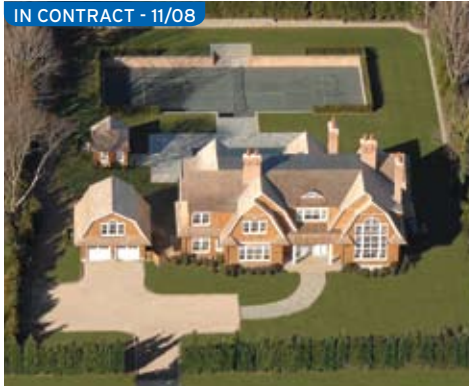
East Hampton. $11.45M WEB# 52844