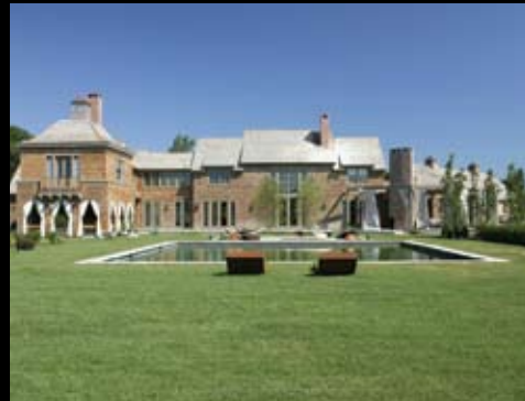
Bridgehampton. Timeless South of the Highway. WEB# 54711 7,000 sq. ft., 8 bedrooms, 8 baths, room for tennis, 3.7 acres.