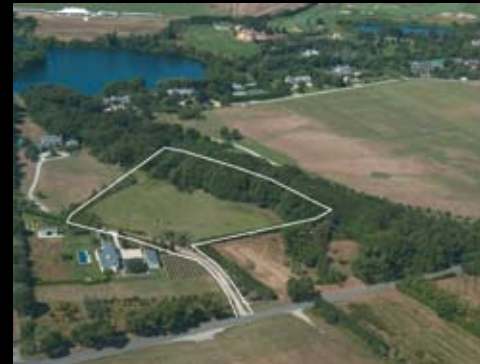
Bridgehampton. Horse Country. WEB# 00806 5.5 acres, room for substantial house, pool and court.