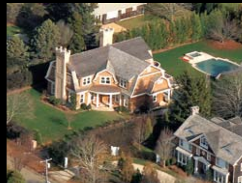
Southampton. Captain's Neck Lane. WEB# 49746 8,000 sq. ft., 6 bedroom, finished basement, pool, pool house.