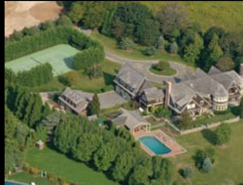
East Hampton. Maidstone Area Estate. WEB# 47839 10,000 sq. ft., 6 bedroom, tennis, pool house, 2.7 acres.