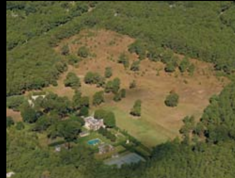
East Hampton. Room To Roam. WEB# 54931 5,500 sq. ft., 4 bedrooms, 5.5 bath, pool, tennis, 13.5 acres.