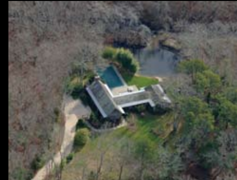
East Hampton. On Georgica Pond. WEB# 49783 2,400 sq. ft., 4 bedrooms, 3 bath, pool, direct pond access.