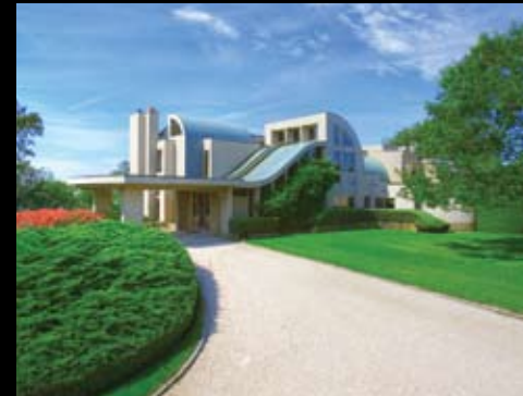
Bridgehampton. Morgan Hill Farm. WEB# 47191 12,000 sq. ft., 800 ft. pondfront, 11.5 acres, south of highway.