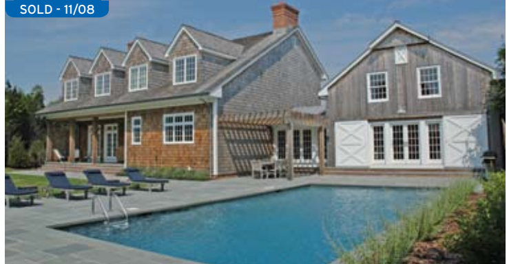
Amagansett. $3.95M WEB# 53617