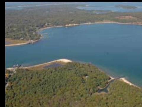
North Haven. Tyndal Point. WEB# 52126 55 acre, 3,000 ft. waterfront, 3 residences, deep water docks.