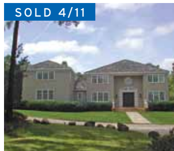
Water Mill. $3.15M*