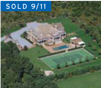
Water Mill. $3.93M*