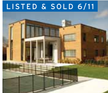
Water Mill. $5.495M*