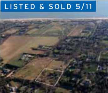
East Hampton. $5.95M*