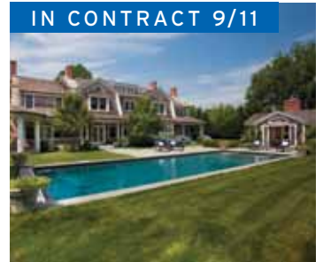
East Hampton. $6.295M*