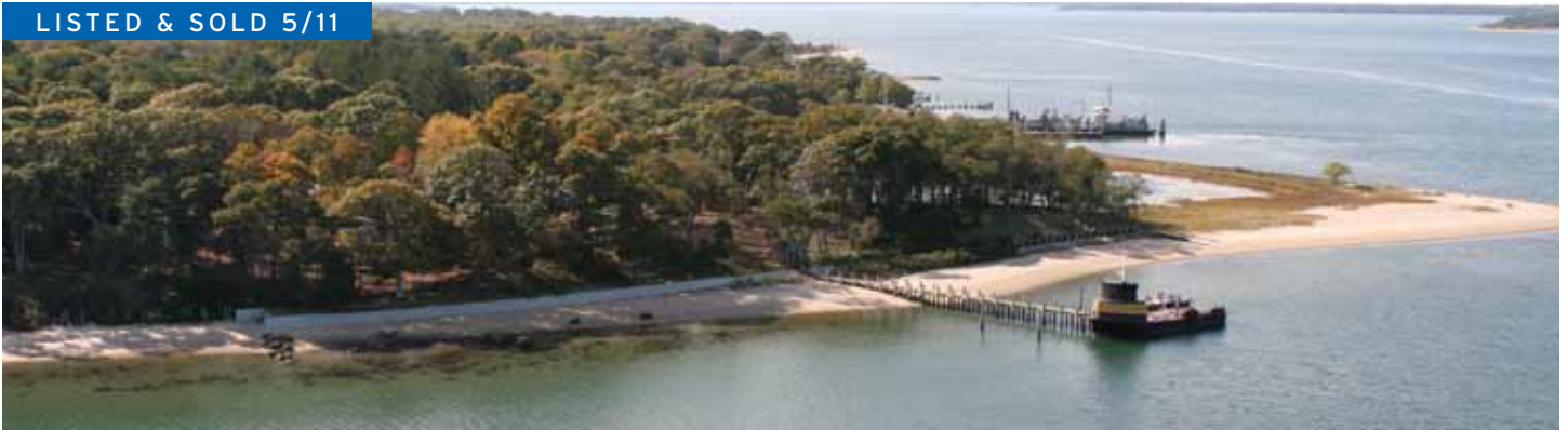
Tyndal Point. $44.99M*