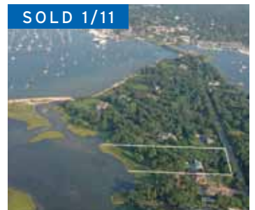
Sag Harbor. $7.9M*