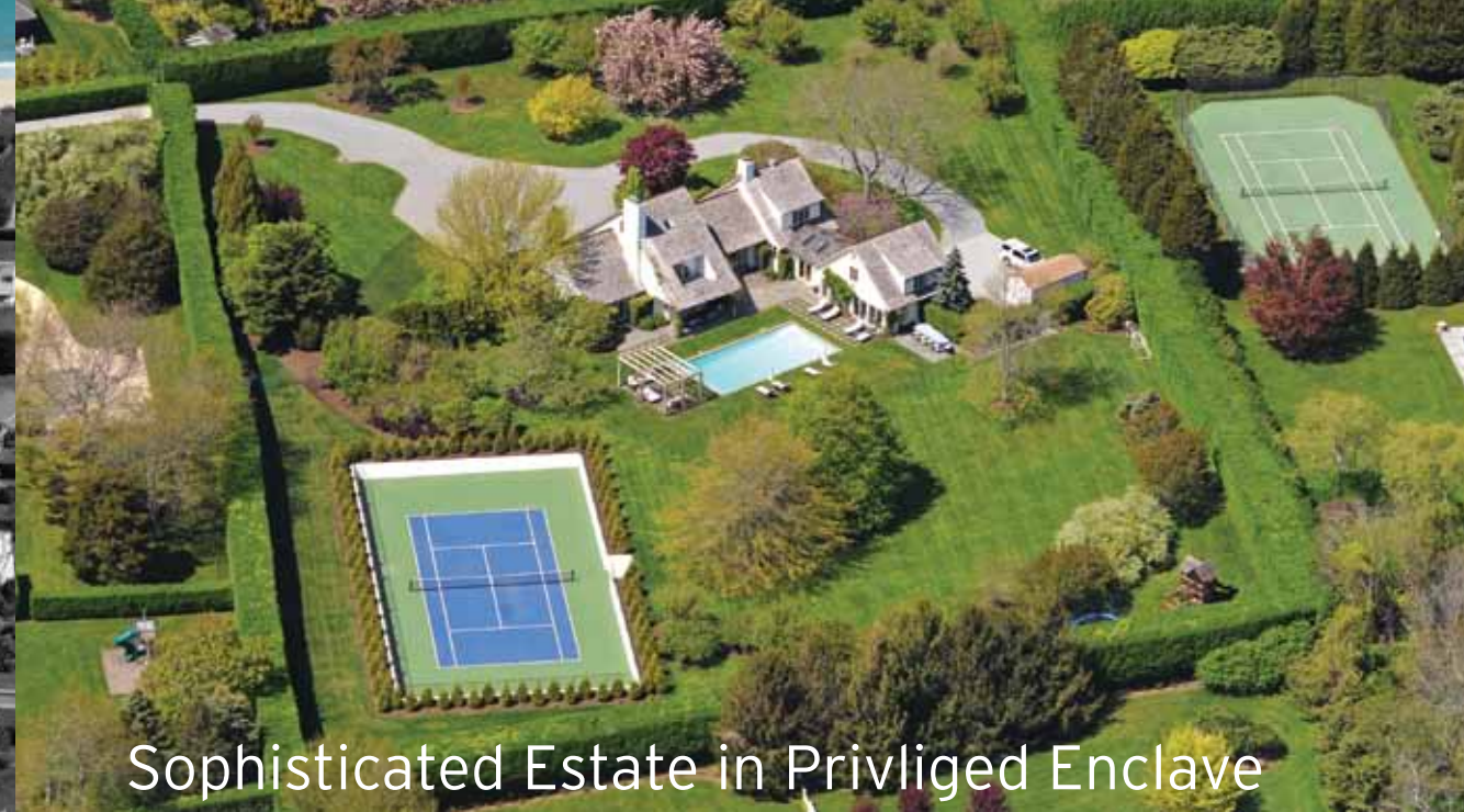
Sophisticated Estate in Privileged Enclave