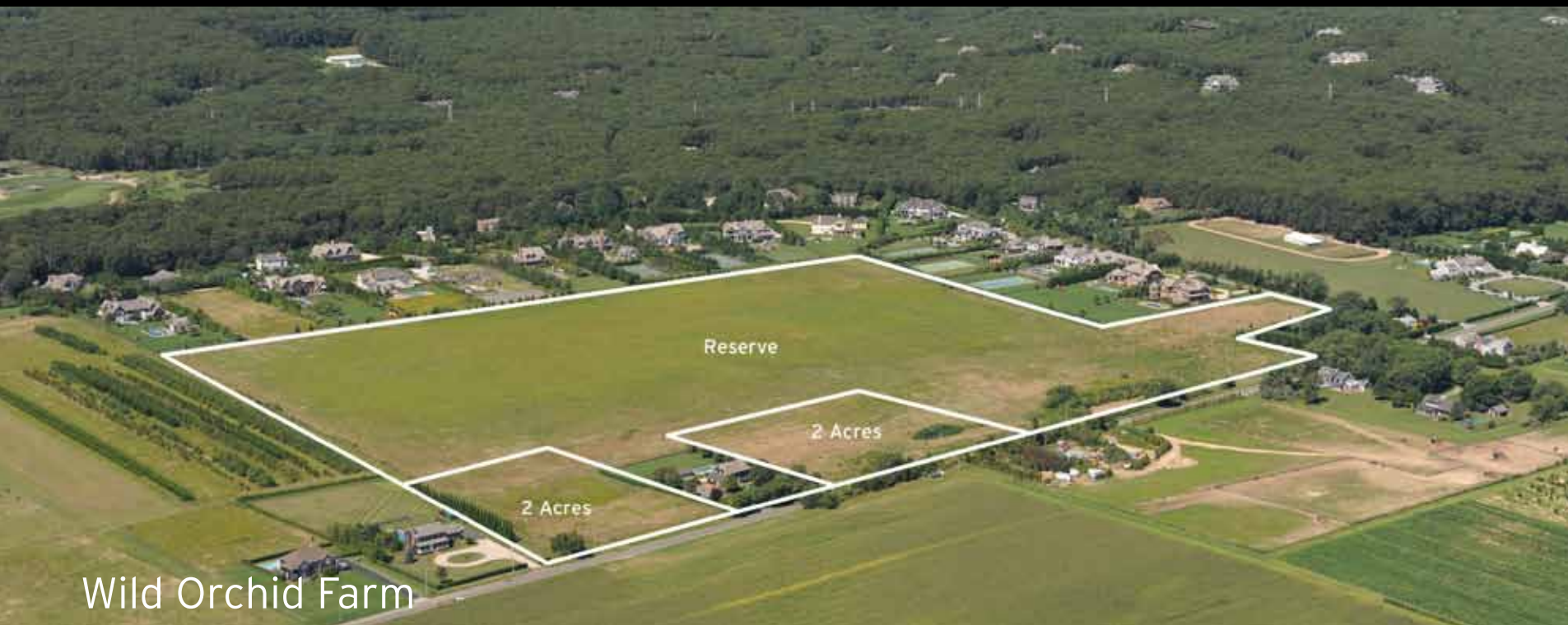
Wild Orchid Farm

Water Mill. More than 36 acres, encompassing a pair of 2+ acre building parcels and a 32 acre reserve, present a variety of interesting scenarios along the farm fields of Water Mill's Deerfield Road. With each lot having room for a significant house, pool, pool house and tennis court and the reserve capable of hosting a significant equestrian facility, the possibilities for fertile minds seems endless. Certainly a compound of two houses and assorted amenities sharing a horse farm comes to mind. A savvy end user/investor could keep a lot for their own Hampton retreat while selling off the remaining lot while giving each an interest in the 32 acre reserve. An enterprising developer might build and offer 2 new houses for sale that would have common interests in the expansive reserve, giving fortunate new owners the ultimate back yard. Explore the myriad possibilities of this unique offering, today.