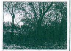
Typical Roadside along Site Facing South