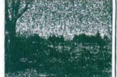
Area just north of Proposed Entry Gates and Drive—Opposite Front Door