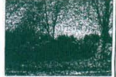
Site of Entry Gates and Drive off of Captains Neck Lane