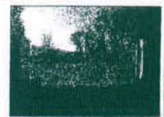
Entry Gate Detail (S.E. Corner of Wicopogue and Barons)