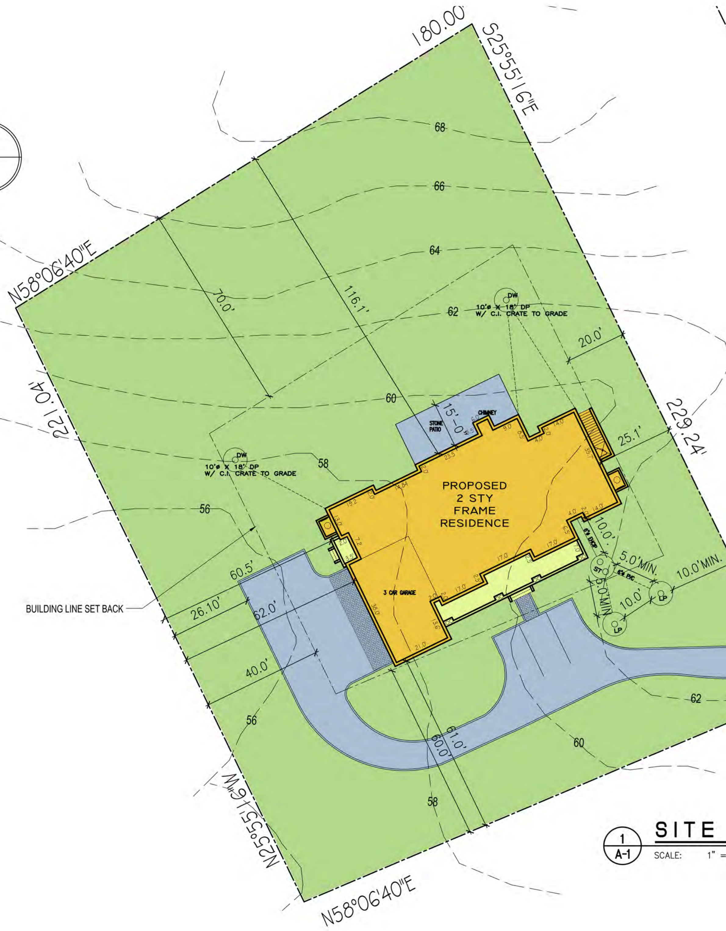
1 SITE PLAN SCALE: 1" = 20'-0"