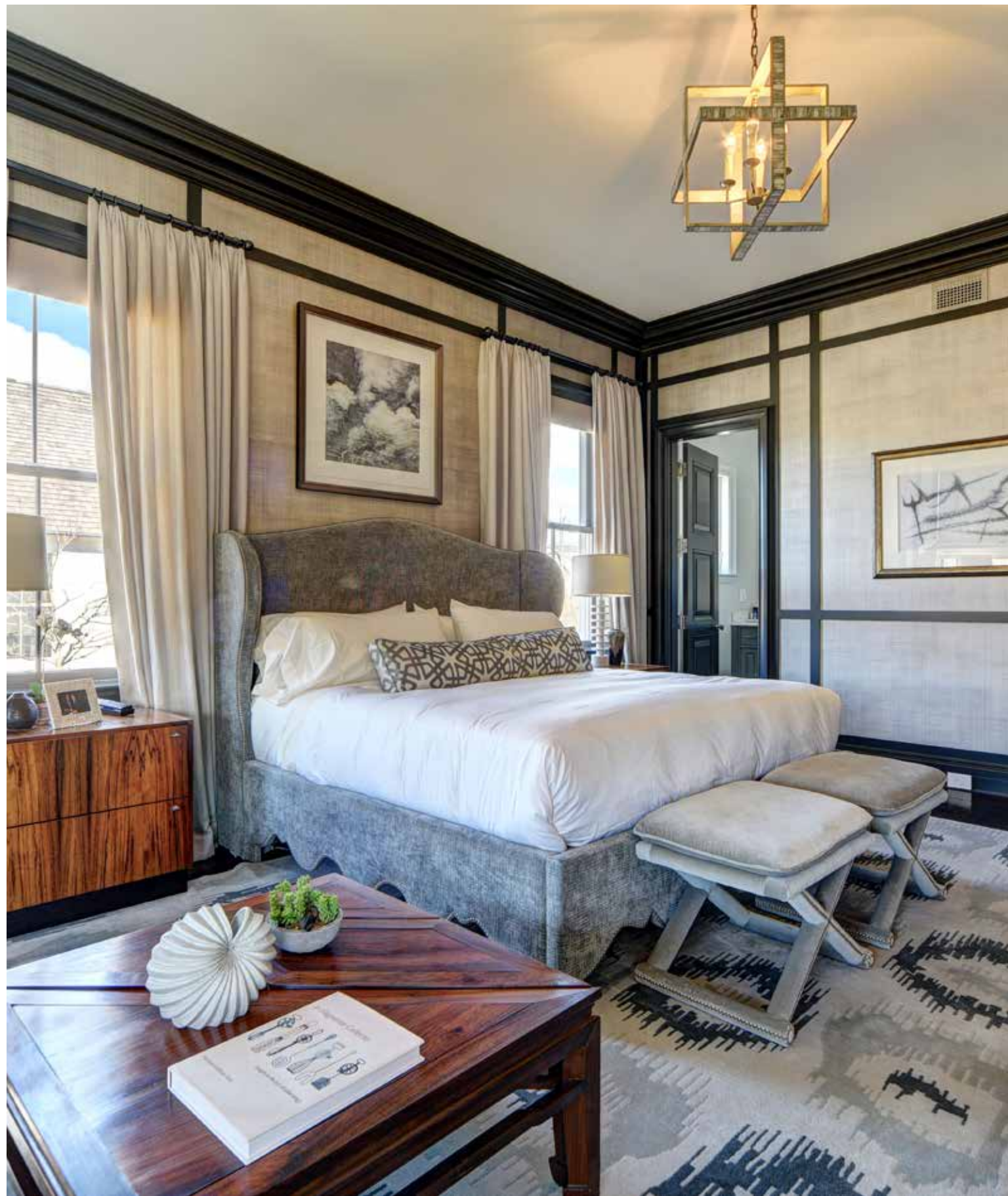
1st Floor Guest Bedroom

A unique bedroom featuring ebonized slatted walls with a custom wall covering in a lustrous finish. The custom rug features organic tribal forms in New Zealand wool. A curvaceous upholstered bed anchors the room, flanked by curtains in wool twill. A seating area in the bay window is flooded with afternoon light. Fabrics by Romo and Holland and Sherry.