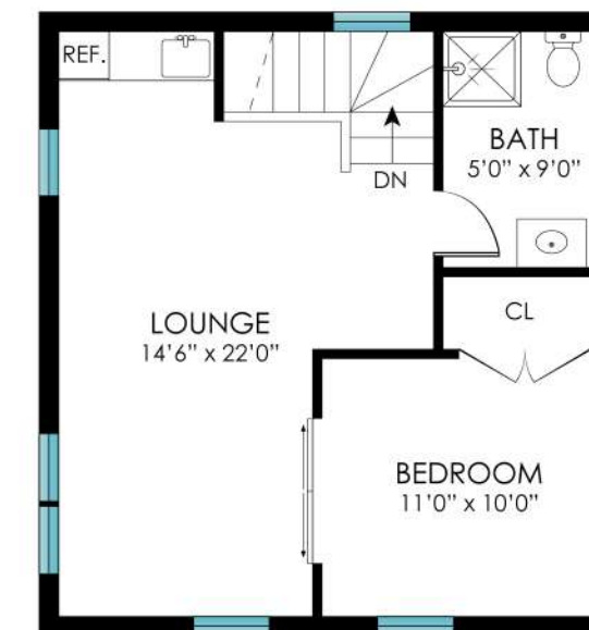
2ND FLOOR EAST ( ABOVE THE GYM )

2ND FLOOR - 3735 SF 2ND FLOOR EAST - 440 SF LOFT - 124 SF